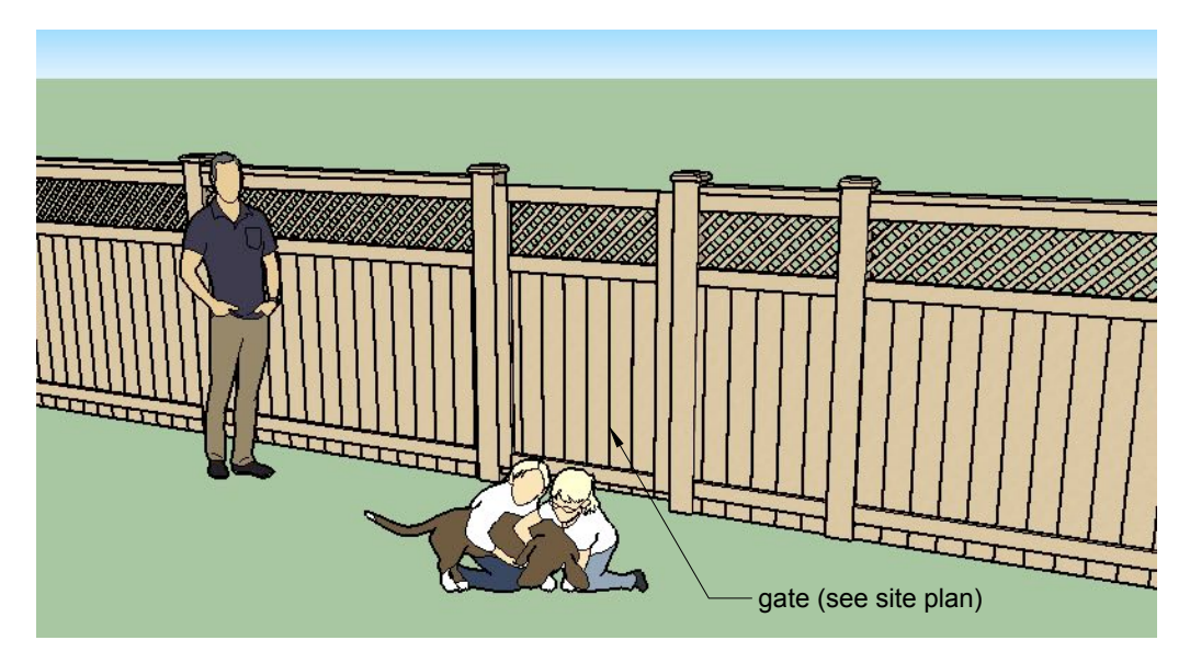
1-A8 A rendering of a proposed new fence alternate as seen from the subject property. A wood lattice top adds an amount of openness to the fence.