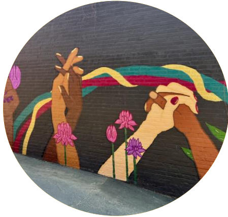
A Place for Everyone