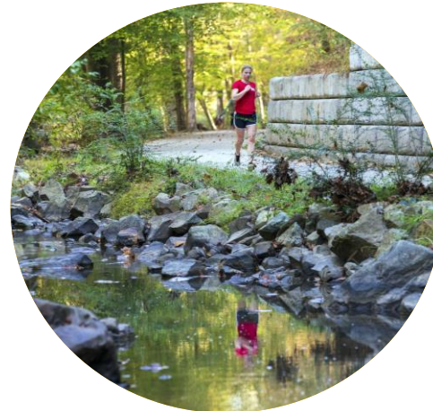
Nurturing Our Community