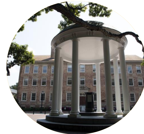
Town & Gown Collaboration