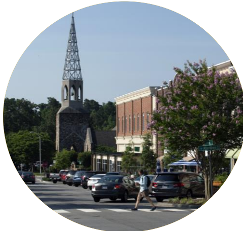
Good Places, New Spaces