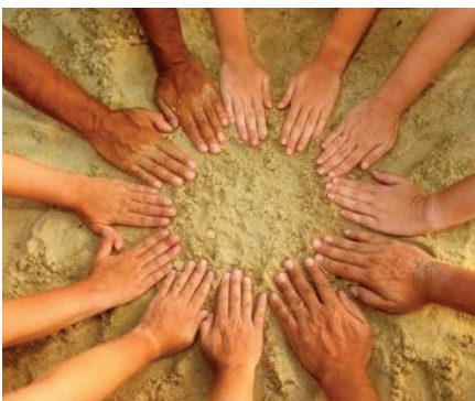
Figure 2 b. Sustainability Diagram

Consistent with the City goal of diversity, the Plan envisions a mix of uses, amenities, housing opportunities, and community facilities to serve a variety of age groups, interests, and income levels. These issues are discussed in more detail in Chapter 4: Land Use and Chapter 5: Community Facilities .