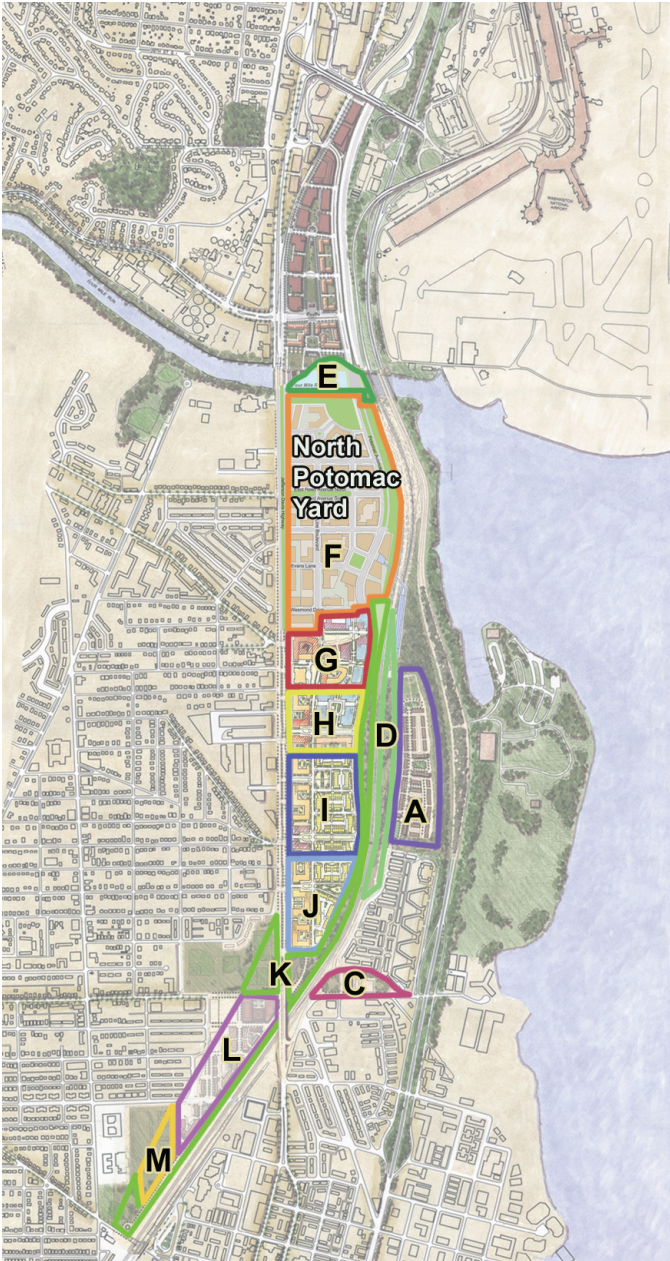
Figure 1. Vicinity and Landbay Map

Note: Landbays within Potomac Yard are geographic areas used for zoning and development purposes.