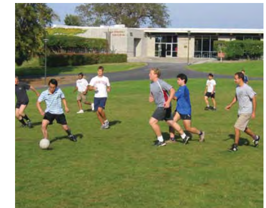
6 RECREATIONAL FIELDS AT YMCA