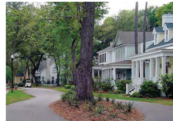
5 TREE SAVE