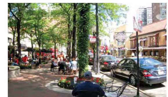
8 URBAN PLAZA/TOWN SQUARE