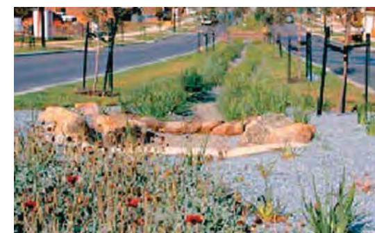
7 GREEN STREET (less urban condition)