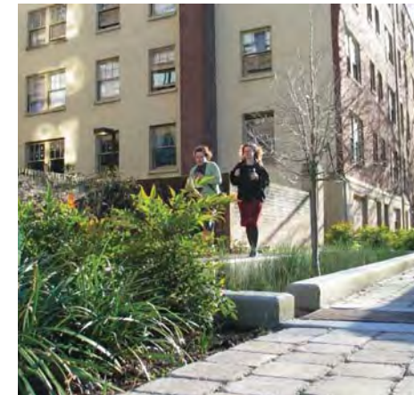
3 GREEN STREET (more urban condition)