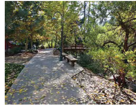
1 2 STREAM-SIDE TRAILS