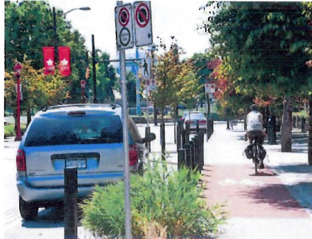
1 SEPARATED BIKE LANE