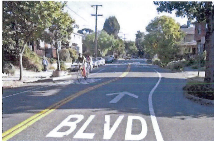
2 BIKE BOULEVARD