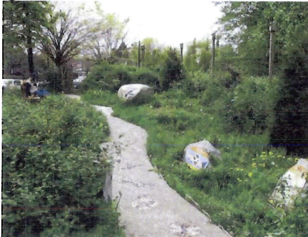
3 OFF-STREET TRAILS