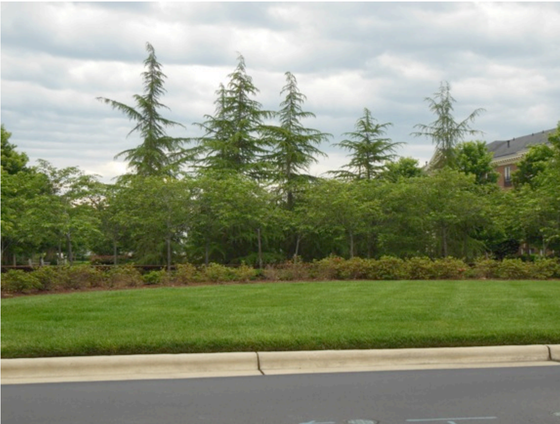
Figure 15 Higher density senior housing seen from road