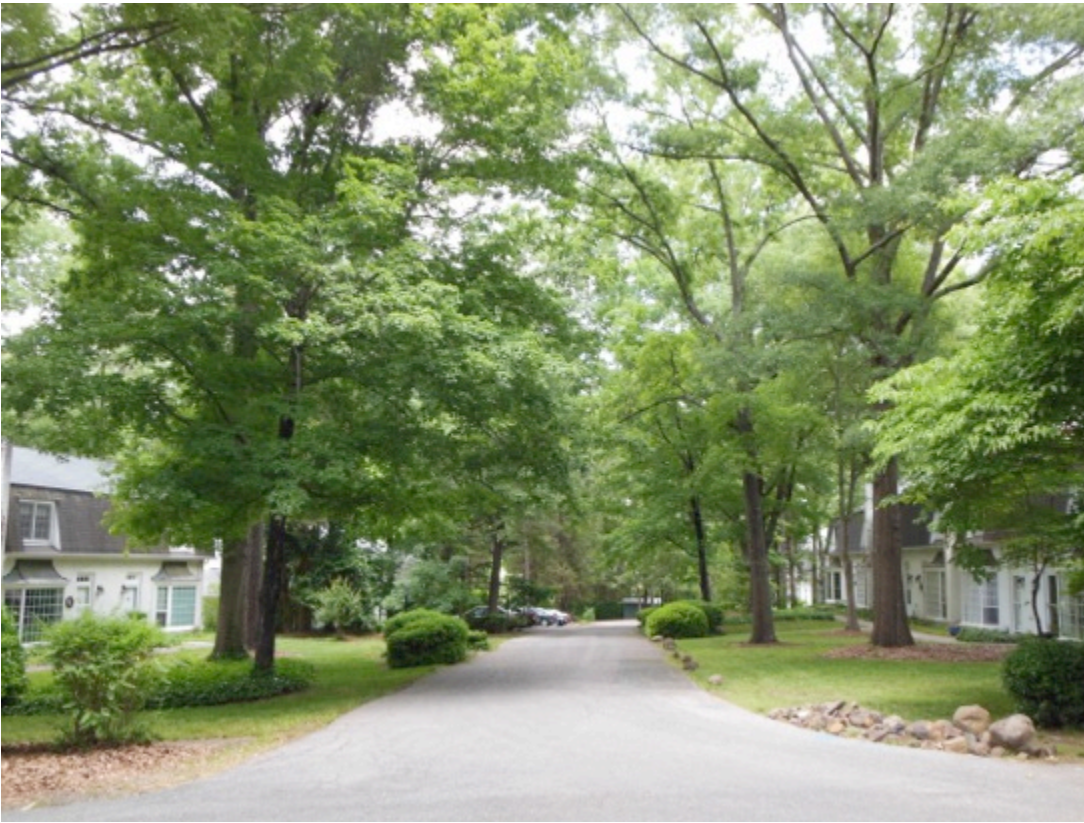
Figure 11 Garden Town Houses