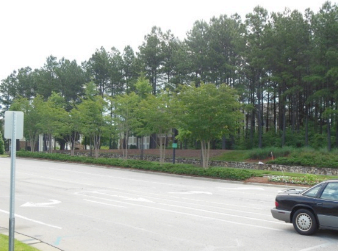
Figure 4 Tree lined paths to split road from development on Estes Dr