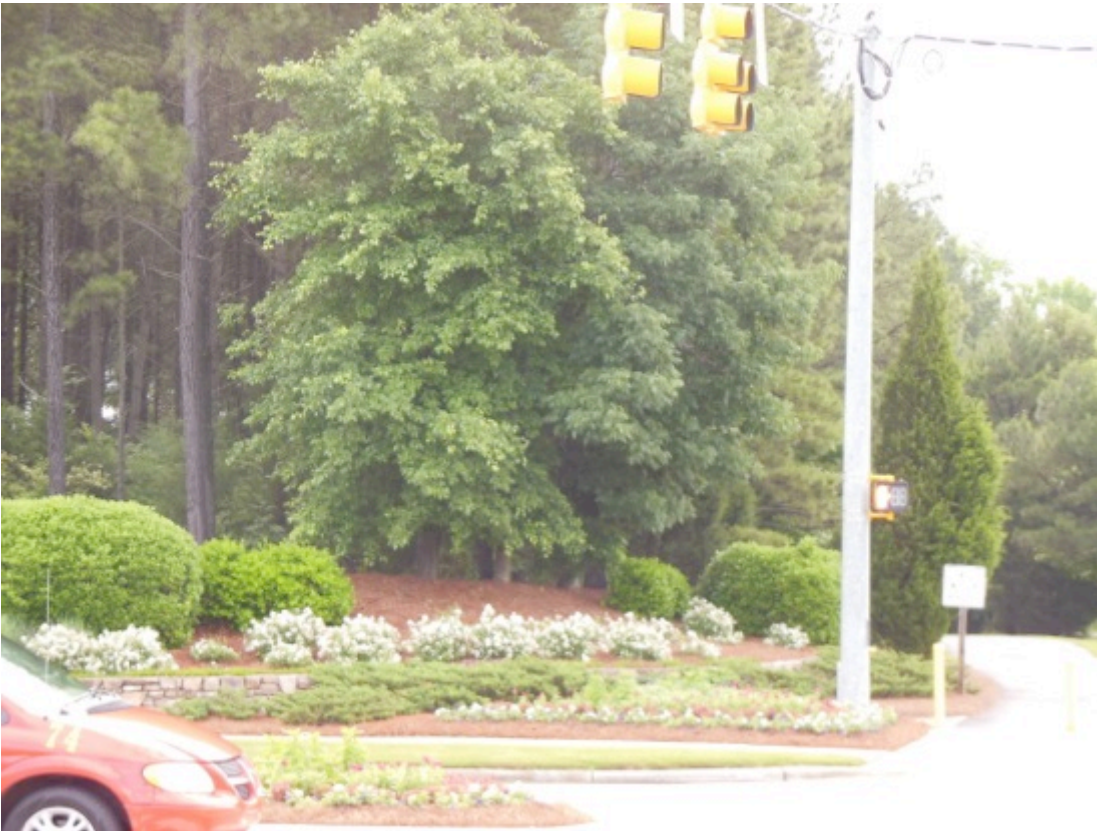
Figure 3 landscape corners to make a welcoming entrance opposite CN