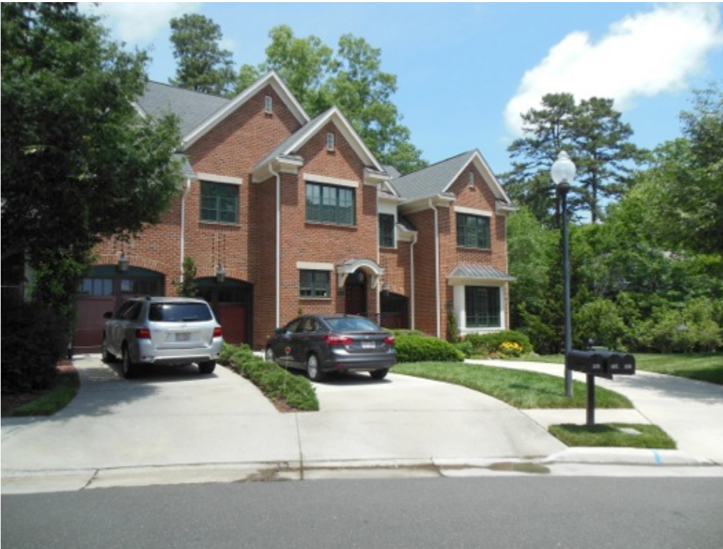
Figure 7 Garden Town Houses