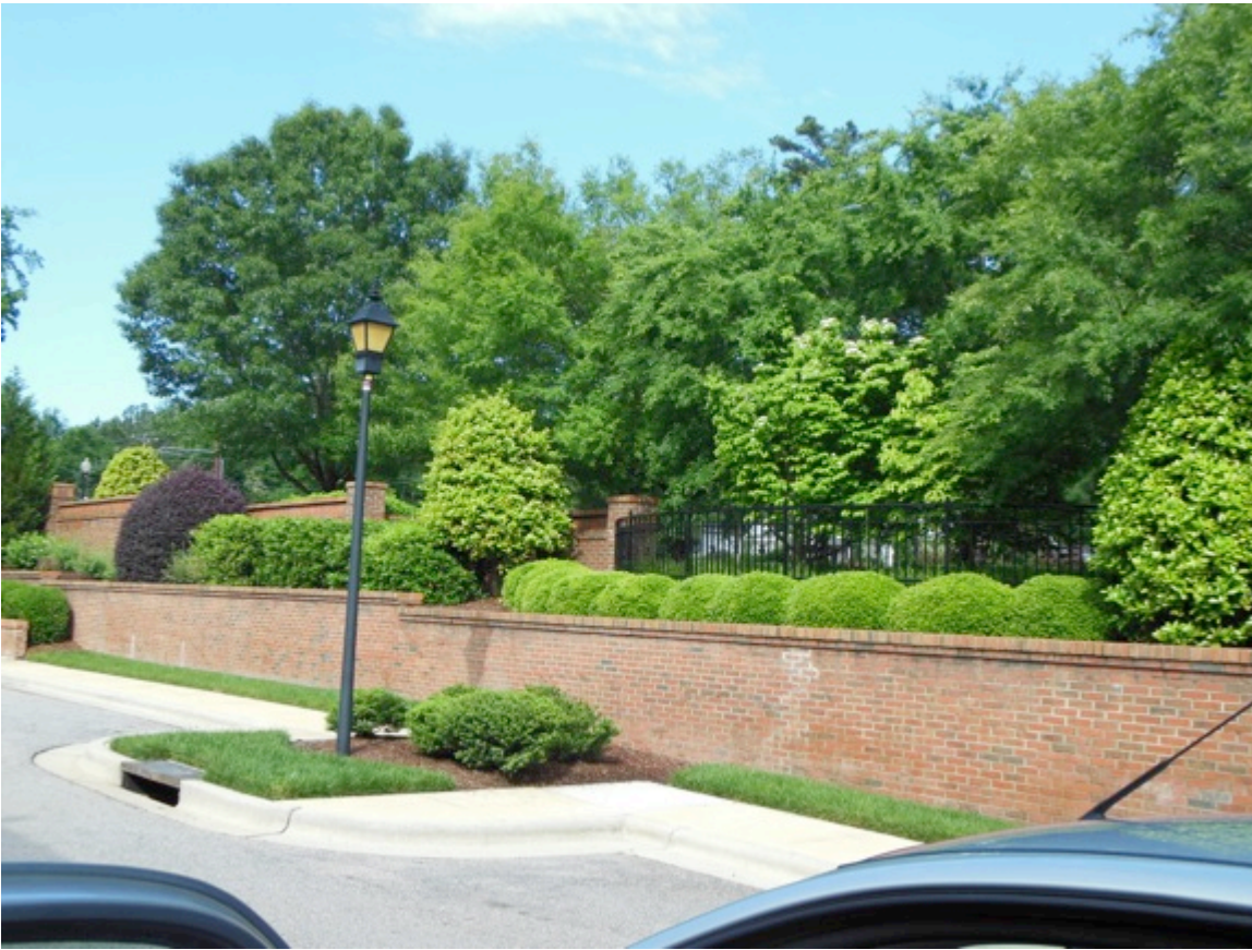
Figure 9 Green roadside buffer - residents side by town houses