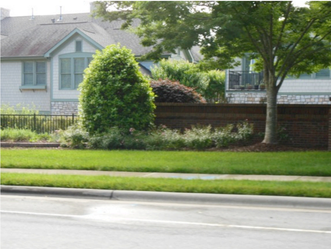
Figure 10 Green Buffer - Estes Rd side by town houses