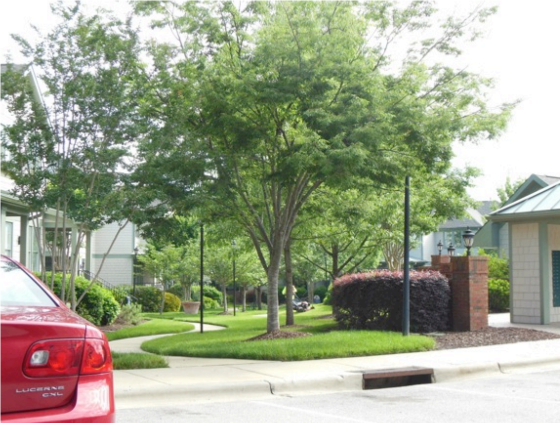
Figure 8 Landscaping between town houses / garden apartments