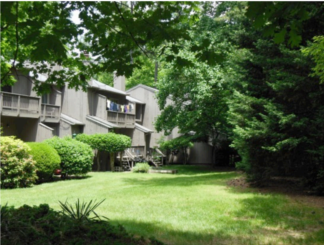
Figure 12 Garden Townhouses