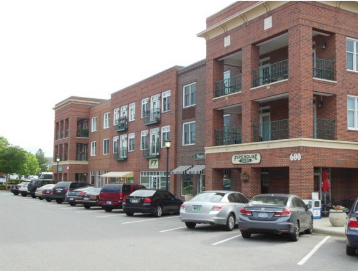
Figure 2 Parking behind commercial buildings (limit to 2 storeys)