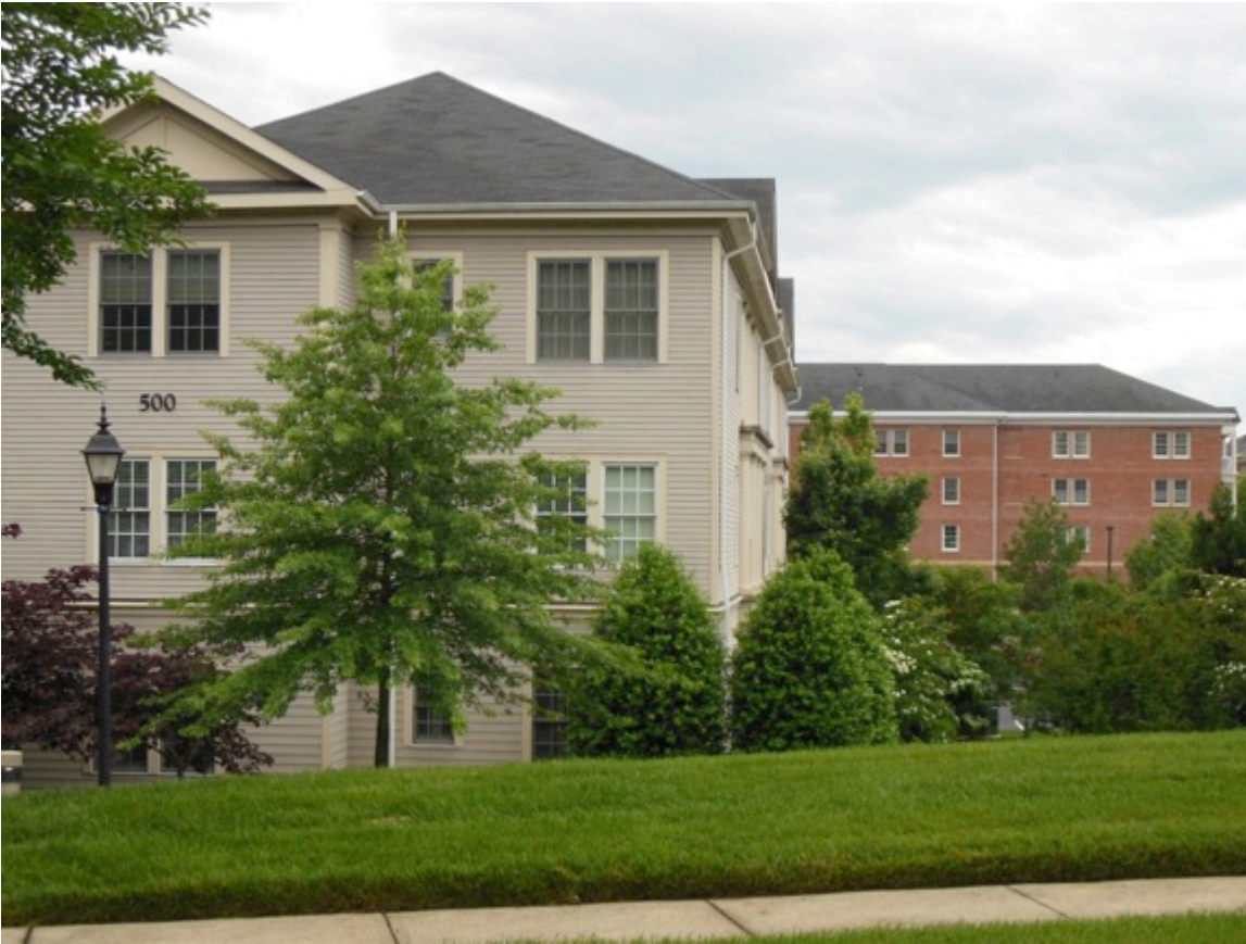
Figure 16 Higher density senior housing built on down slope