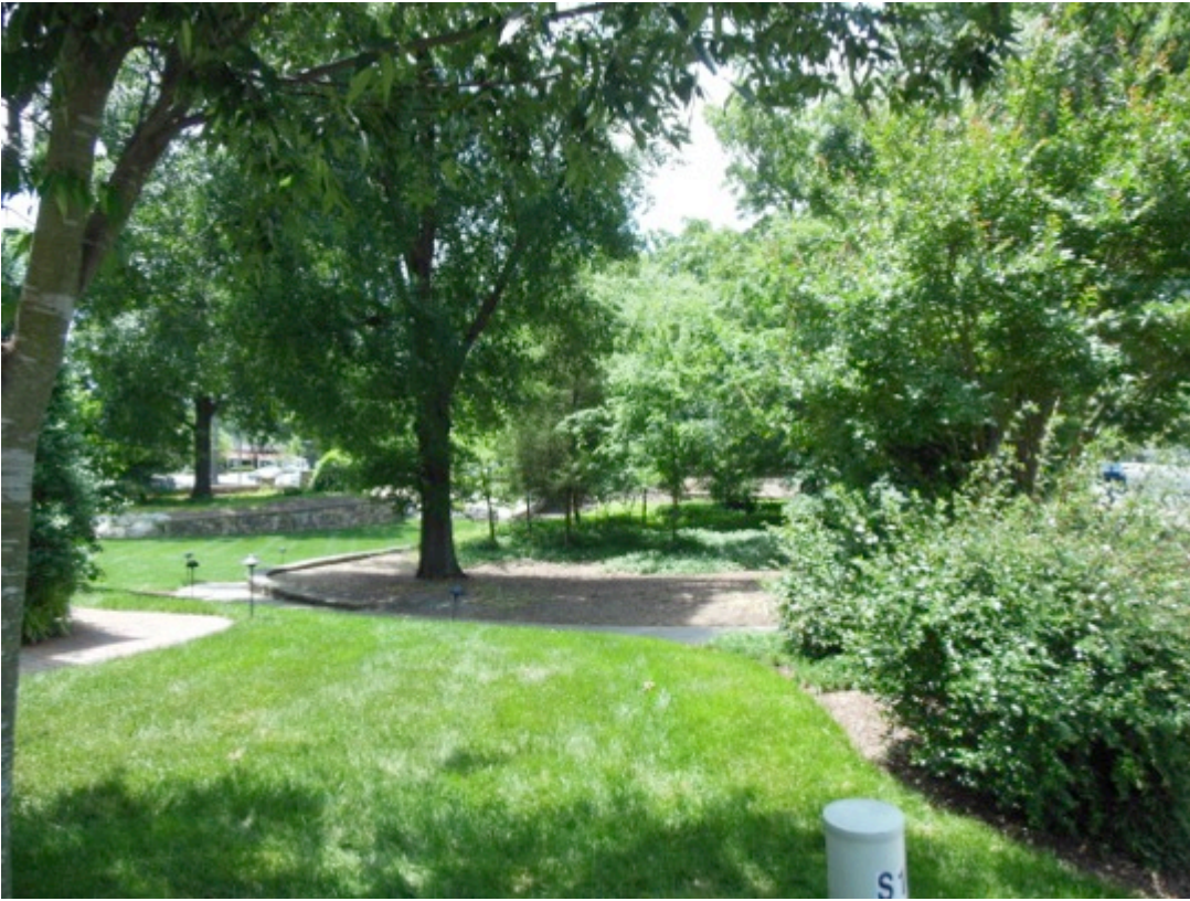
Figure 13 Open park near retail area