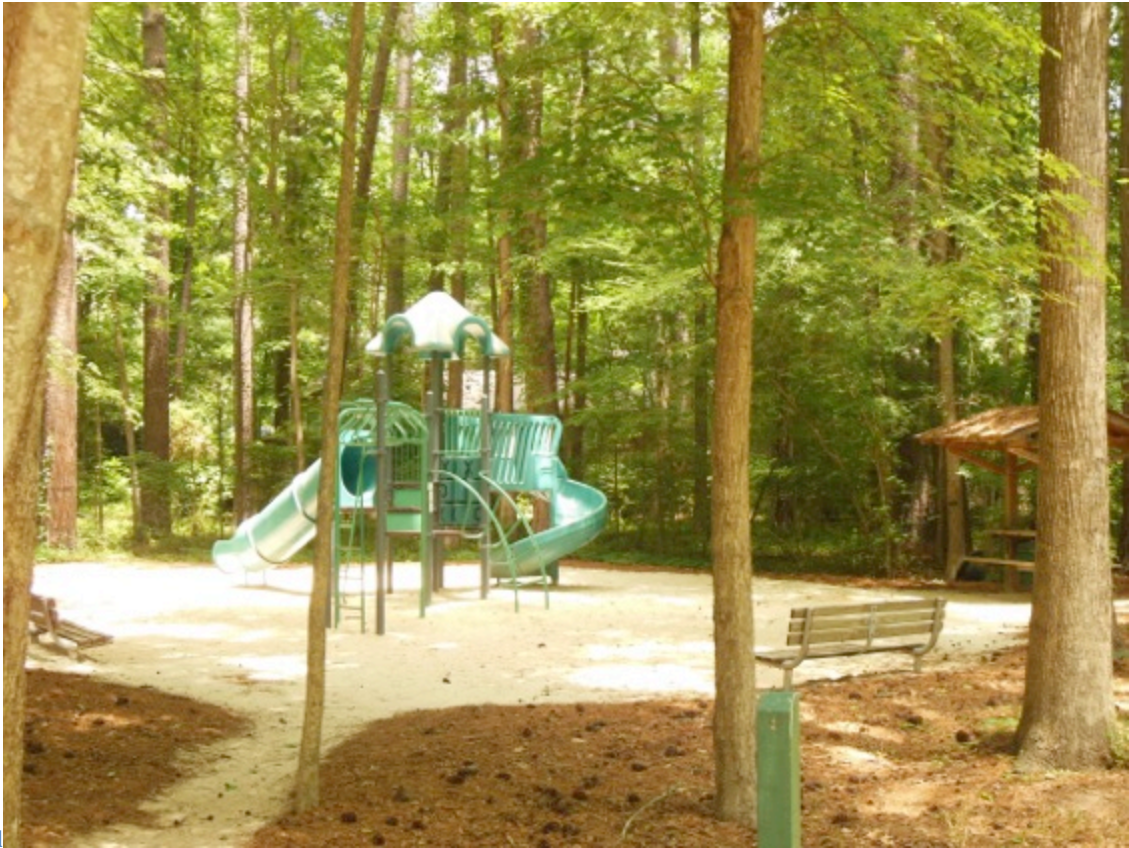
Figure 14 Play area in park suitable for pre-school +