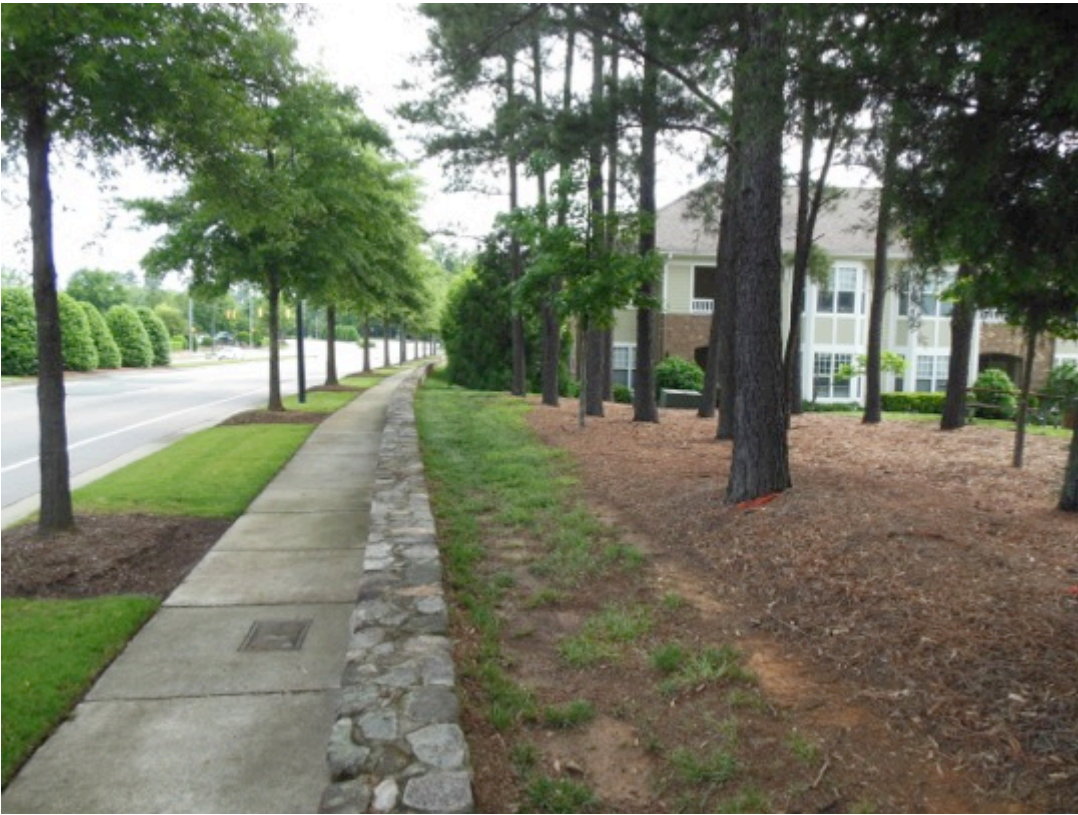
Figure 5 Tree lined paths to split road from development on Estes Dr