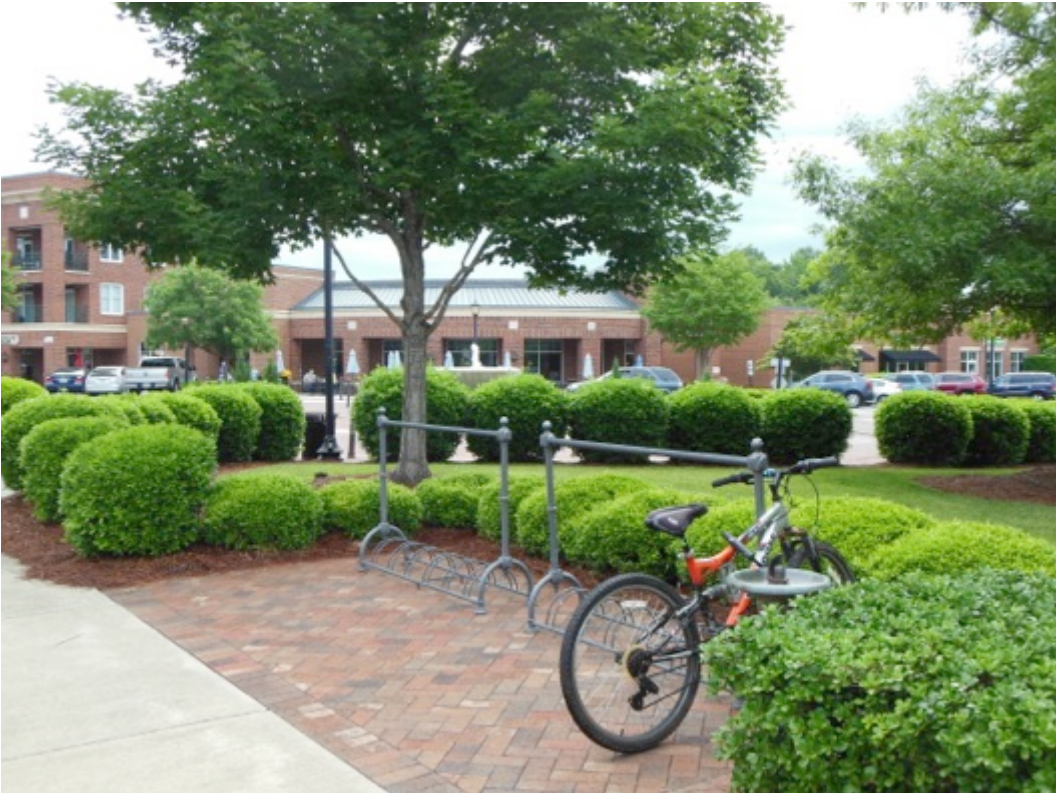
Figure 18 encourage off road access in park