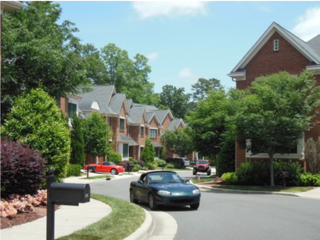
Figure 6 Garden Town Houses