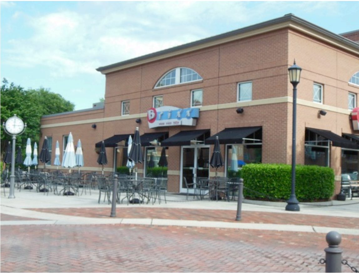
Figure 1 Parkside cafe's on low rise building