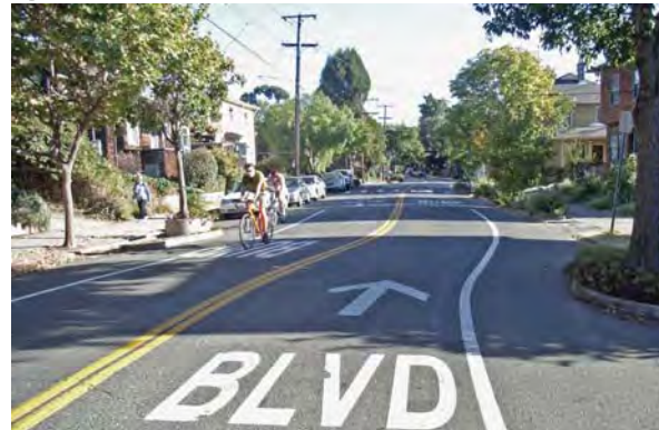
2 BIKE BOULEVARD