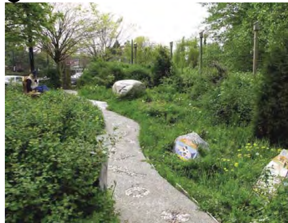
3 OFF-STREET TRAILS