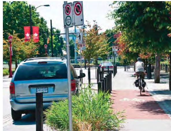
1 SEPARATED BIKE LANE