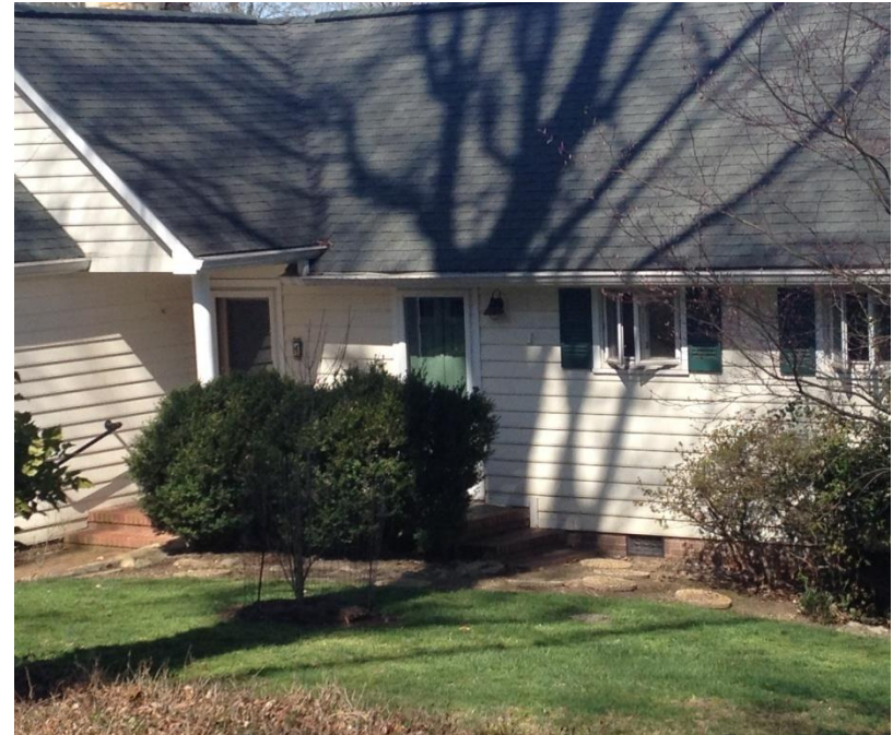
Proposed Style on Neighboring House