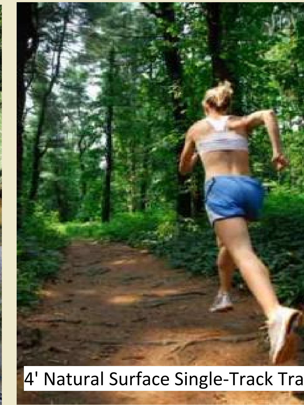
4' Natural Surface Single-Track Trail