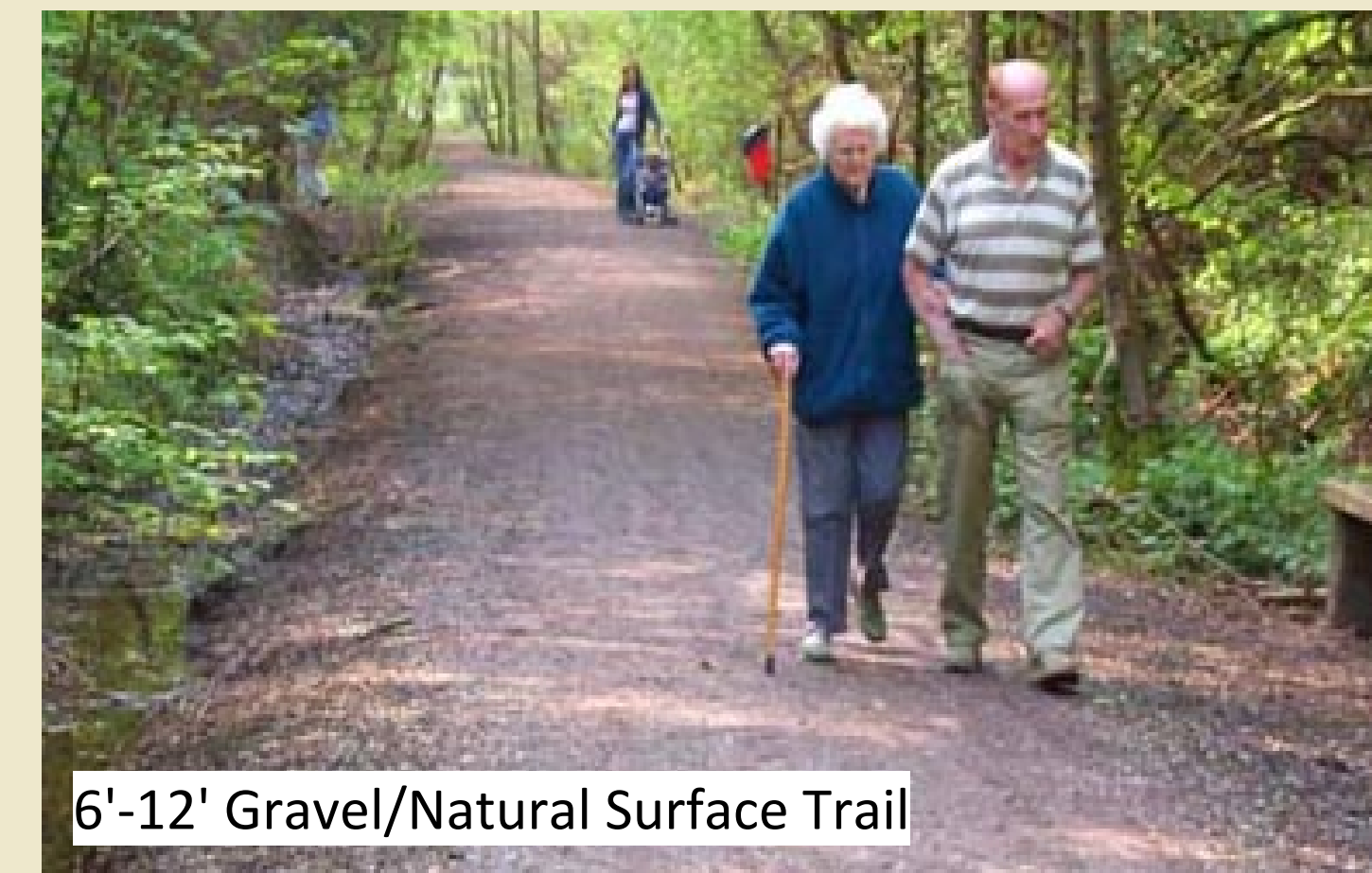
6'-12' Gravel/Natural Surface Trail