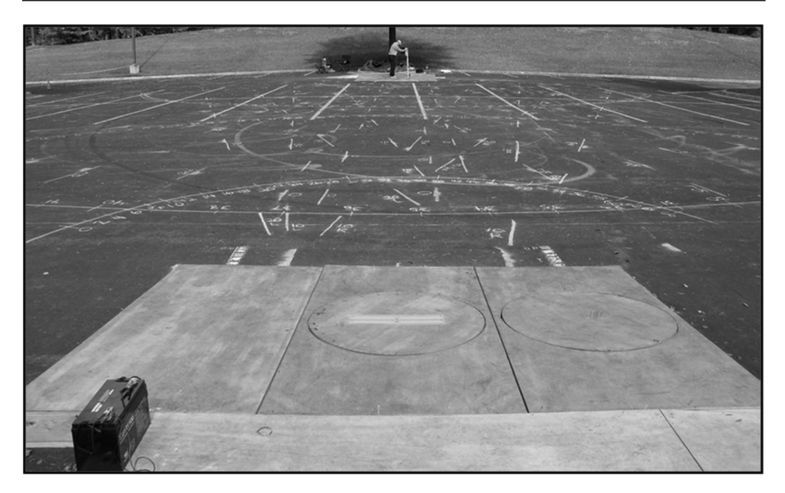
Figure 2. Experimental ramp structures and site layout.

(representing the sidewalk at the top of a ramp) and a 12-foot-wide by 8-foot-long ramped surface, at a slope of 1:12, secured to the landing (1:12 is the maximum slope permitted by the regulations of the Americans with Disabilities Act). The two structures were installed approximately 80 feet apart with ramps facing one another but slightly offset (see Figure 2).