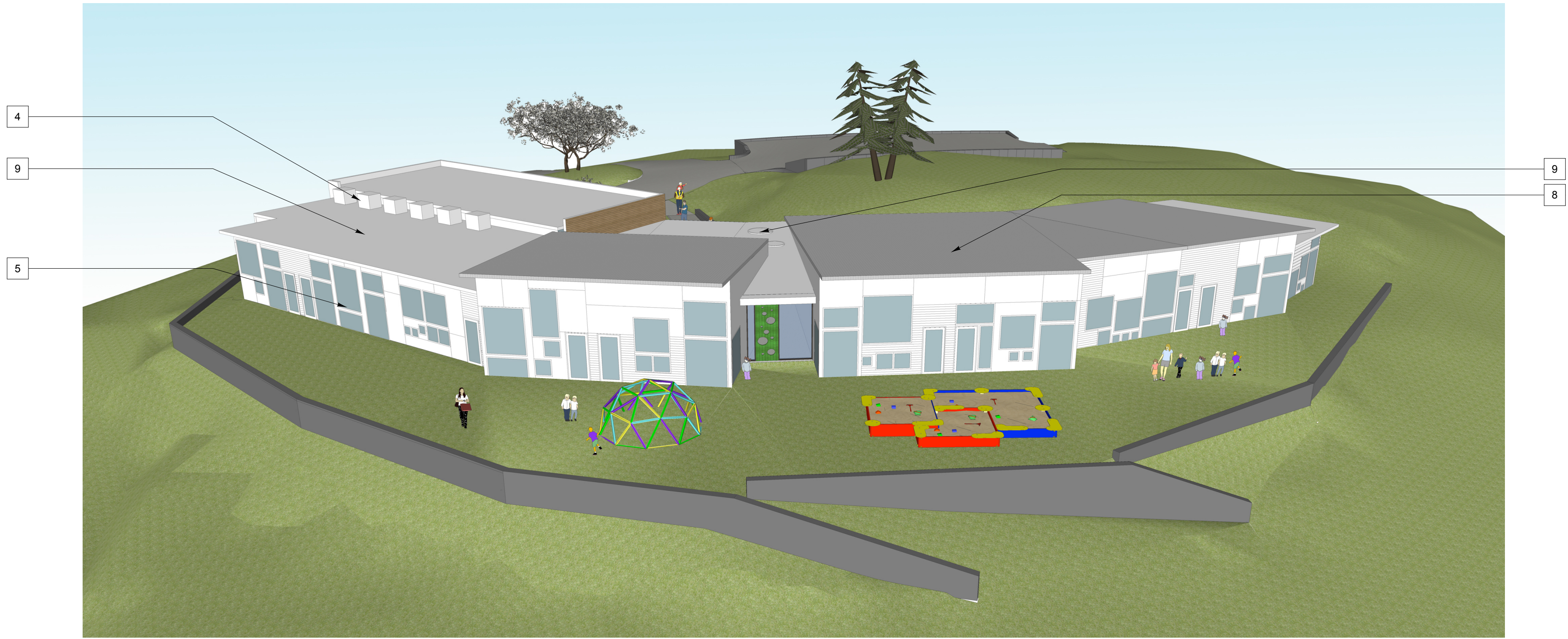
1 aerial view, looking southwest A2.02 no scale