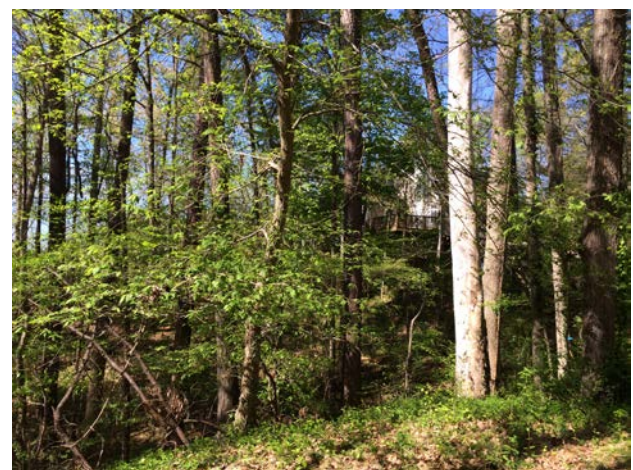
(7) Residential properties west of subject property. (8) Woods between residential property and project