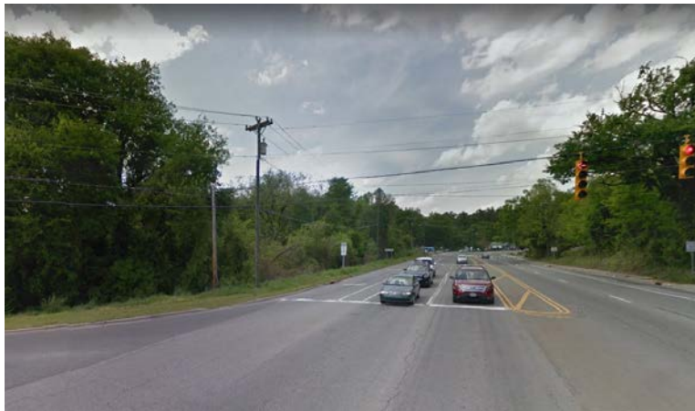
(2) Site as seen from South Columbia / NC 54 overpass.