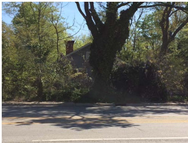
(4) Houses across South Columbia Street facing project site. View from project site.