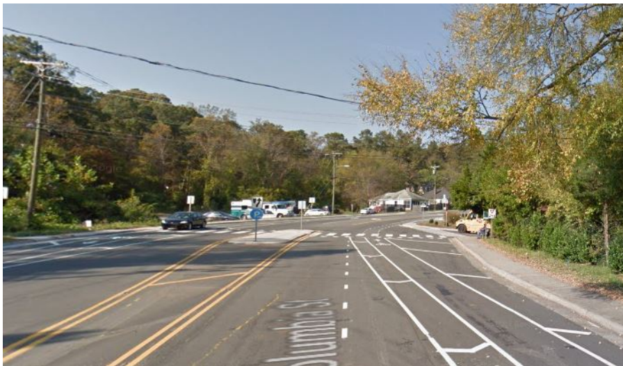
(11) Crosswalk and gravel lot north of project site.