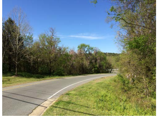
(5) View of NC54 westbound on-ramp from project site.