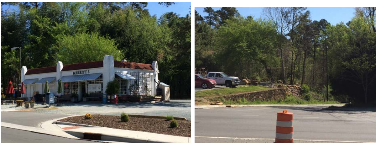
(3) View of Merritt's Store and Purefoy intersection from project site.