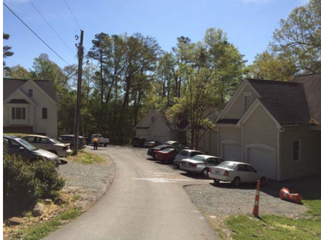
(8) Rental properties northwest of project site.