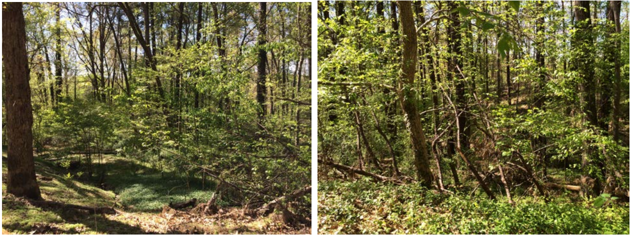
(10) View into project site along Monroe right of way, from northwest, and view toward proposed building.