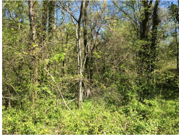
(6) View of project site from NC54 westbound on-ramp.