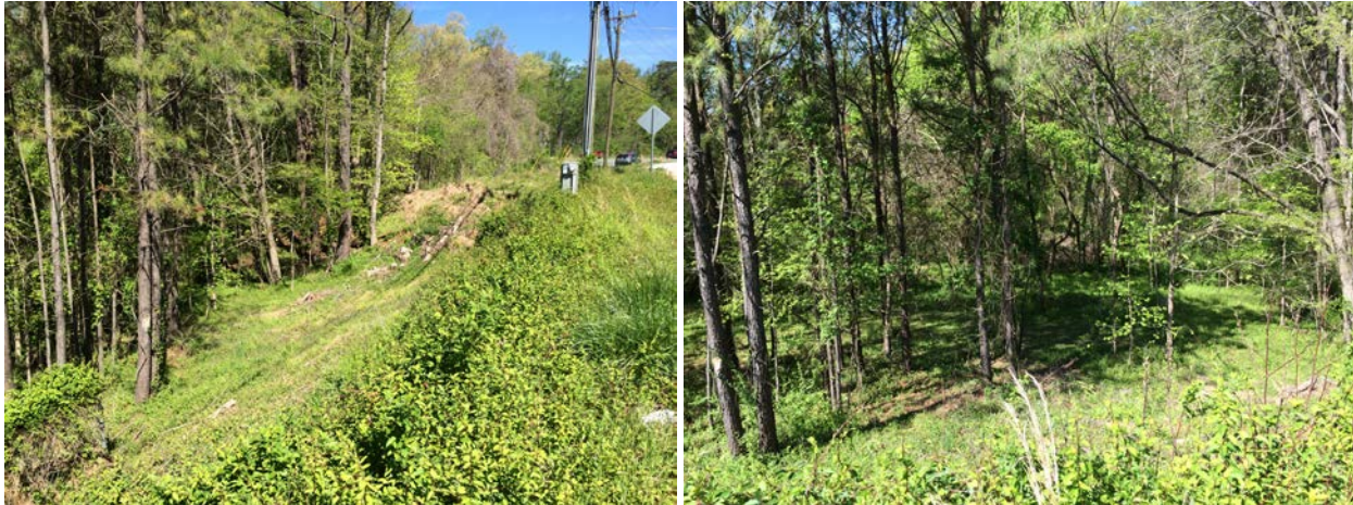
(1) Project site, view from South Columbia Street