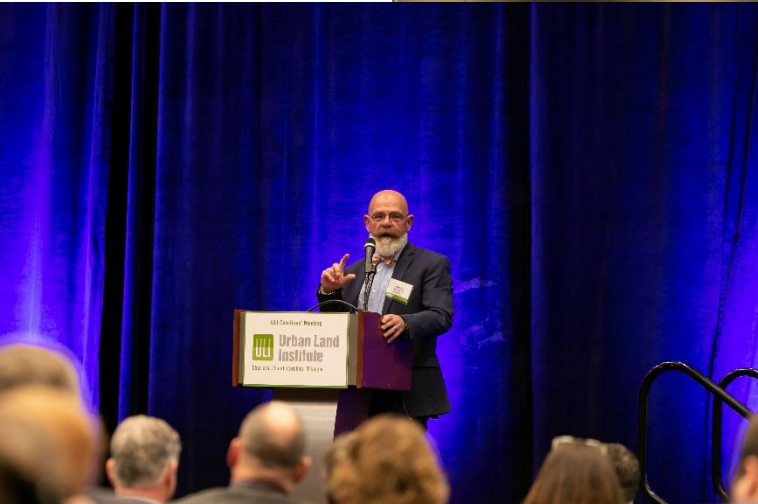
Bringing welcome at ULI Carolinas Meeting (750 in attendance)