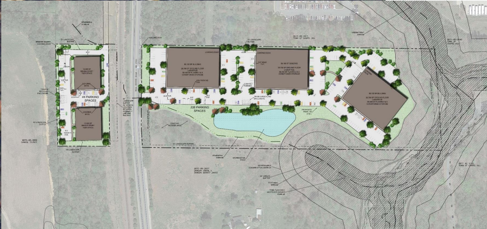
Enterprise Zone prospect