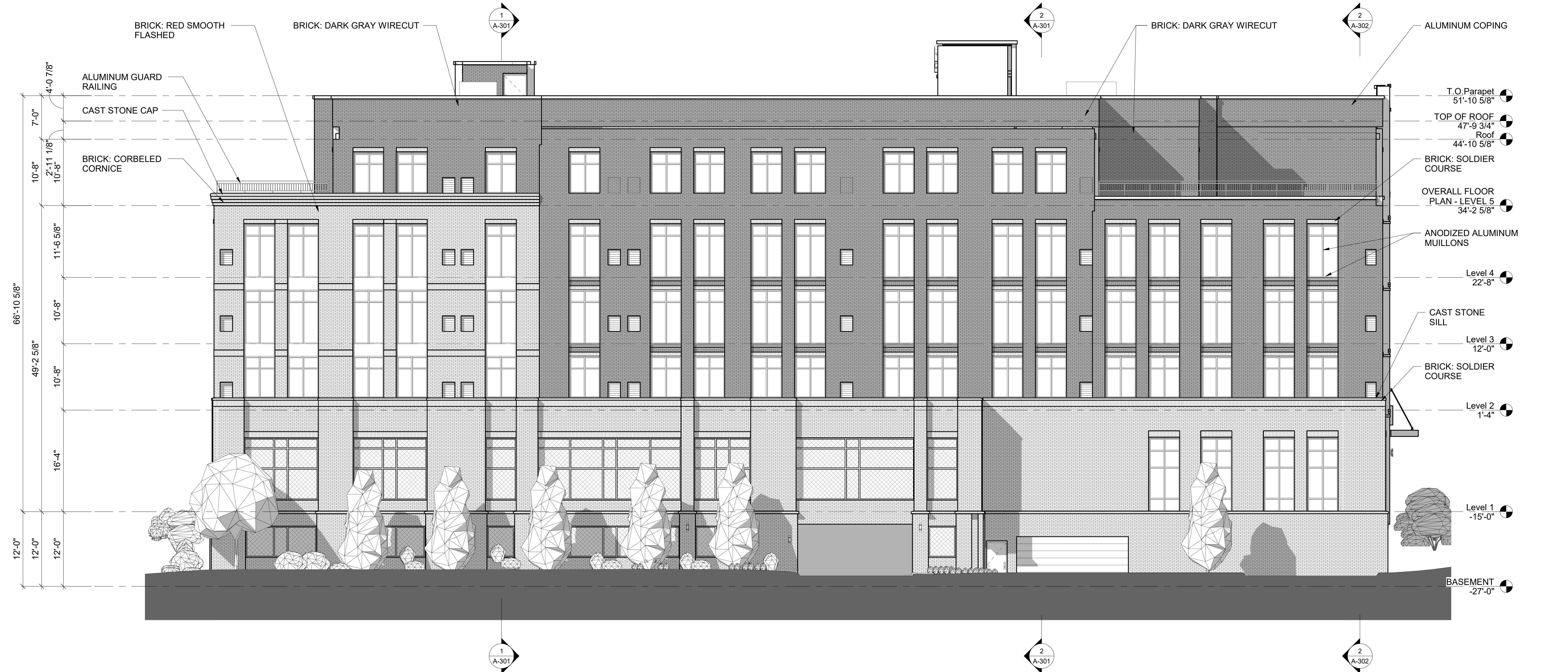
2 EXTERIOR BUILDING ELEVATION Scale: 1/8" = 1'-0" Ref. from: 17/A-100

ALL DESIGNS, DRAWINGS AND SPECIFICATIONS DEPICTED ON THIS SHEET ARE THE PROPERTY OF R4 ARCHITECTURE P.A. ANY UNAUTHORIZED USE OR REPRODUCTION IS SUBJECT TO LEGAL PROSECUTION. POSSESSION IN ANY FORM CONSTITUTES ACCEPTANCE OF THESE CONDITIONS. COPYRIGHT 2020