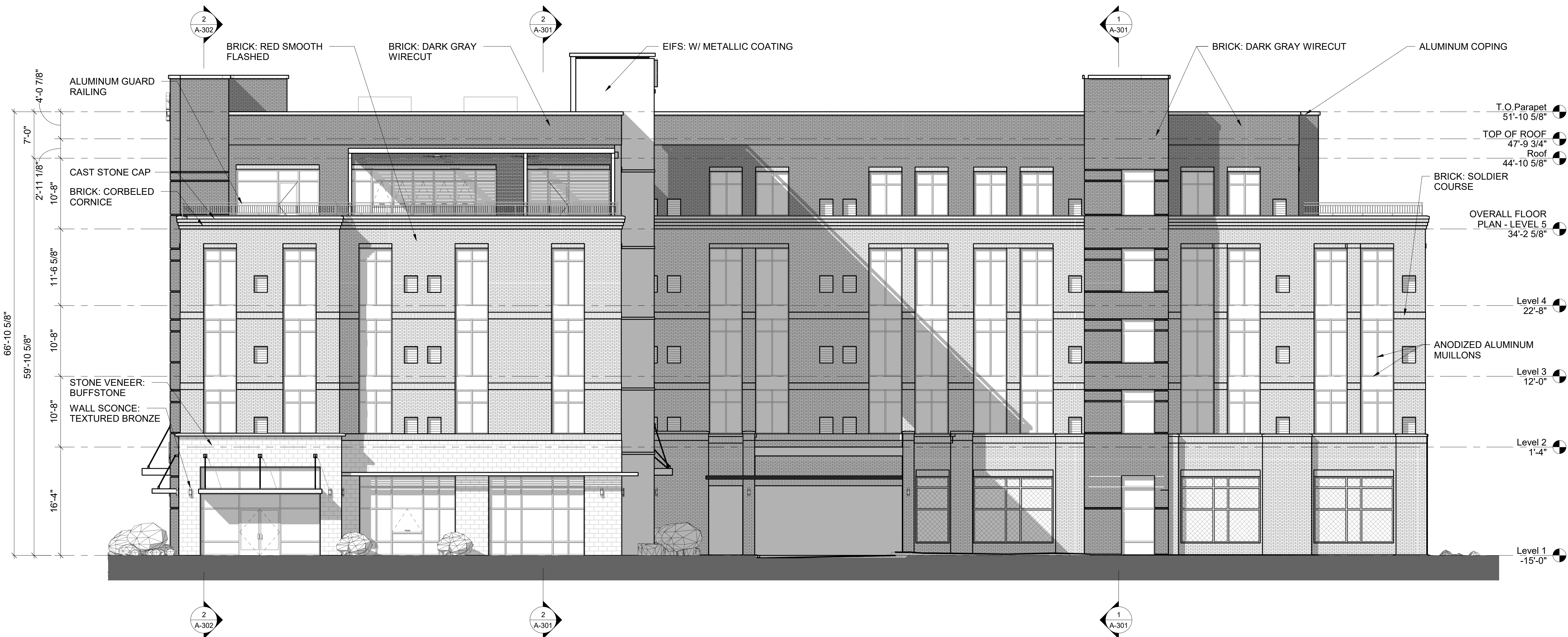
1 EXTERIOR BUILDING ELEVATION Scale: 1/8" = 1'-0" Ref. from: 1 / A-101

ALL DESIGNS, DRAWINGS AND SPECIFICATIONS DEPICTED ON THIS SHEET ARE THE PROPERTY OF R4 ARCHITECTURE P.A. ANY UNAUTHORIZED USE OR REPRODUCTION IS SUBJECT TO LEGAL PROSECUTION. POSSESSION IN ANY FORM CONSTITUTES ACCEPTANCE OF THESE CONDITIONS. COPYRIGHT 2020