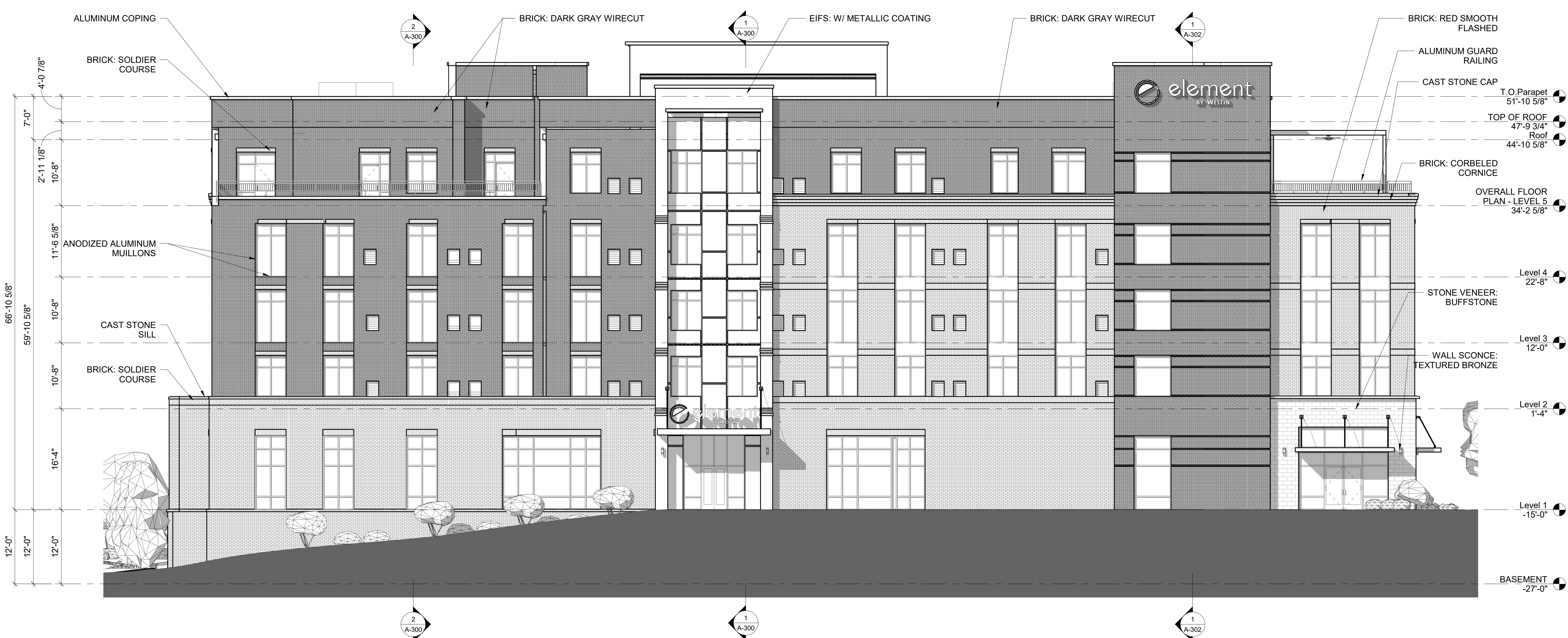
2 EXTERIOR BUILDING ELEVATION Scale: 1/8" = 1'-0" Ref. from: 1 / A-100

REFERENCE NOTES REFER TO DESIGN STANDARDS, "SITE & BUILDING EXTERIOR" CHAPTER FOR MAIN REQUIREMENTS RELATED TO THIS SHEET. GENERAL NOTES 1. BUILDING ELEVATIONS ARE APPROXIMATE AND WILL VARY BASED UPON STRUCTURAL SYSTEM. 2. REFER TO EXTERIOR FINISH INDEX FOR MATERIALS AND COLORS. 3. PROVIDE INTERNAL DOWNSPOUTS, GUTTERS, ROOF DRAINS, AND OVERFLOWS AS REQUIRED FOR LOCAL RAINFALL. PROVIDE SECONDARY OVERFLOWS TO DAYLIGHT IN AREAS THAT WILL NOT DRAIN ACROSS WALKING SURFACES. 4. IF EQUIPMENT IS LOCATED ON THE ROOF, SCREEN EQUIPMENT SO THAT IT IS NOT VISIBLE TO THE GUEST AT GRADE LEVEL. 5. REVEALS VARY IN DEPTH AND WIDTH ACROSS BUILDING ELEVATION. 6. ALL EXTERIOR FINISH MATERIAL SHOULD BE SELECTED FROM A SINGLE VENDOR TO AVOID CONFLICTING INSTALLATION DETAILS AT BUILDING EDGE AND CORNERS.