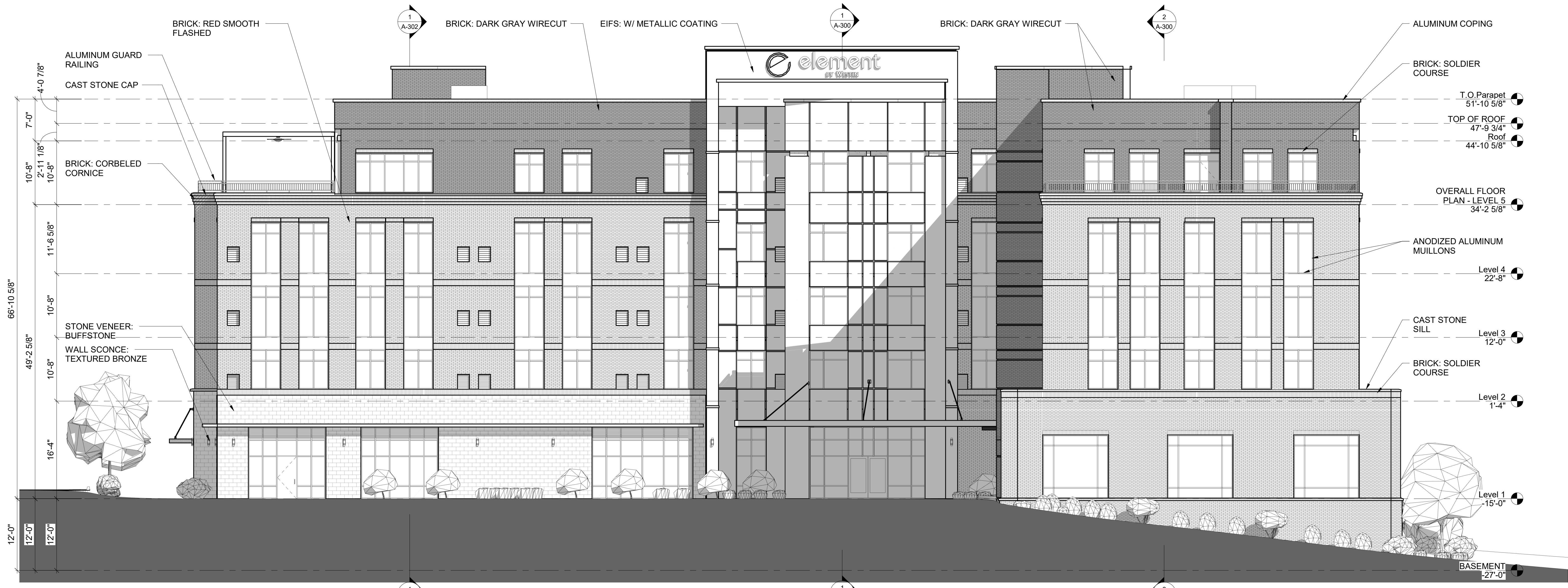
1 EXTERIOR BUILDING ELEVATION Scale: 1/8" = 1'-0" Ref. from: 17/A-100

CRITERIA NOTES CRITERIA NOTES ARE SHOWN PREFIXED BY DISCIPLINE AND COULD BE INTERPRETED TO APPLY TO MORE THAN ONE DISCIPLINE FOR EFFICIENCY. NOTES ARE ONLY SHOWN UNDER ONE PREDOMINANT DISCIPLINE. CONSULTANTS SHOULD BE FAMILIAR WITH ALL CRITERIA NOTES.