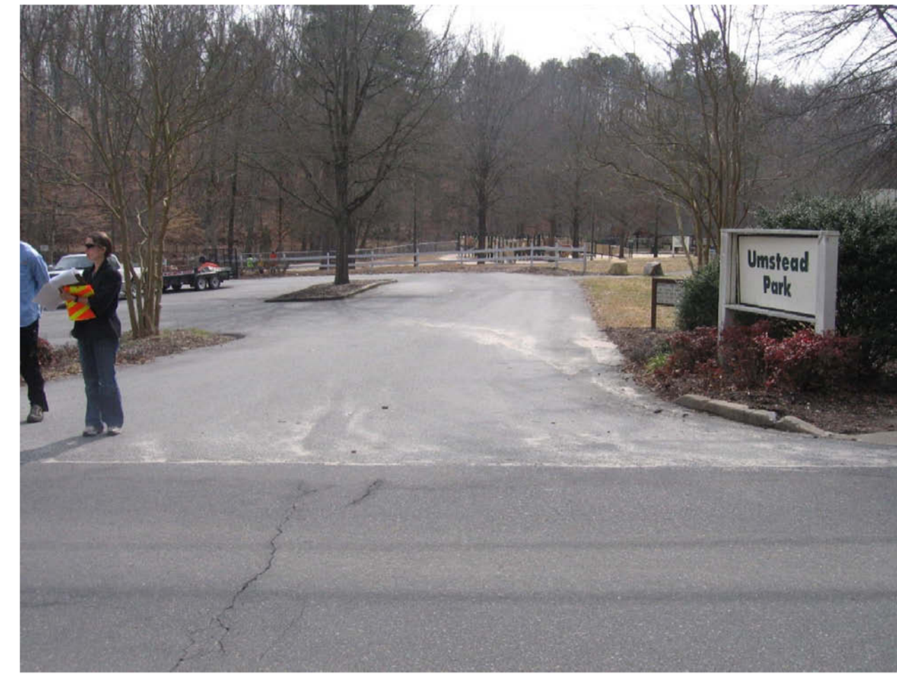
8. B1/B2 – Entrance to Umstead Park – route turns south.