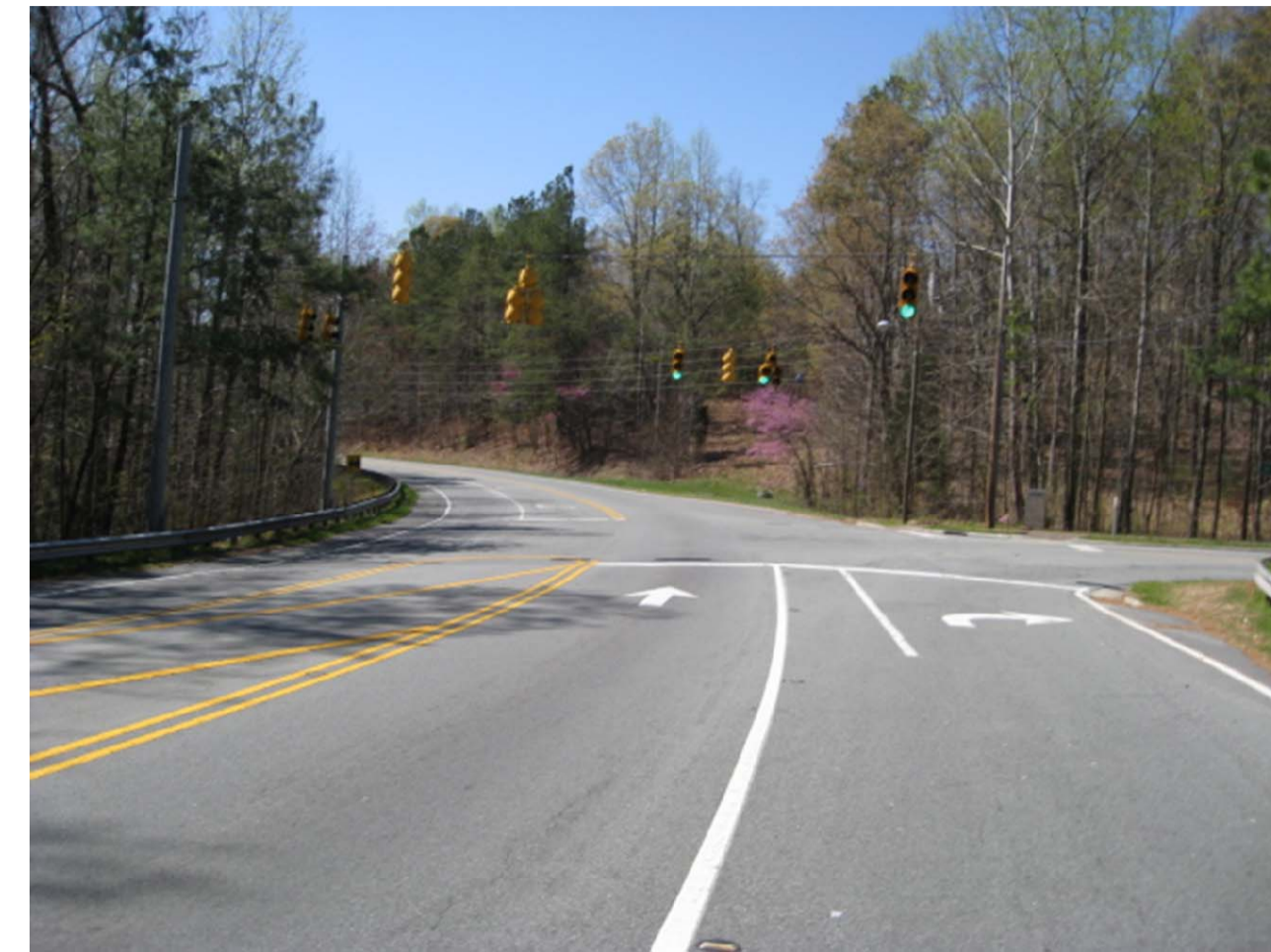
3. A1/A2 – Approaching intersection of Estes Dr. Extension/Seawell School Road – traveling south.