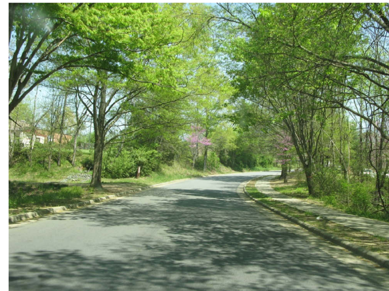
21. B5 – Caldwell St./Church St. Route - traveling east to Church St.