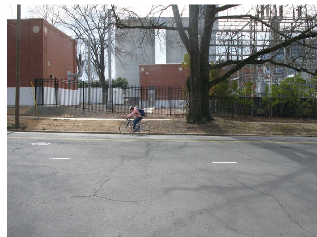
28. B7 – Mitchell/Rosemary/Roberson/Cameron Route - Roberson at Cameron Ave – looking south towards Co-Gen plant.