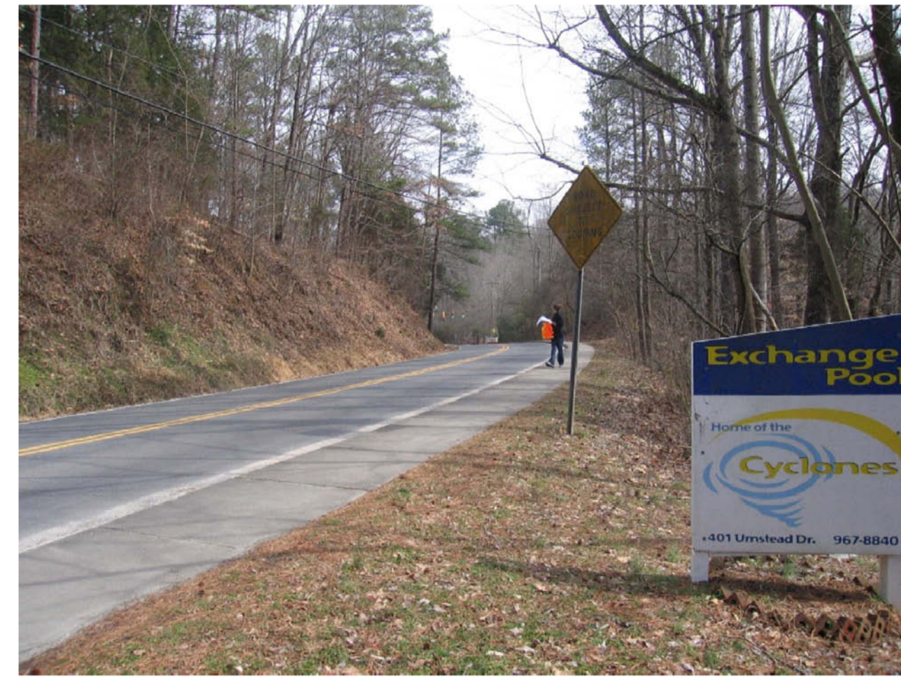
7. B1 – Heading south east on Umstead Drive.