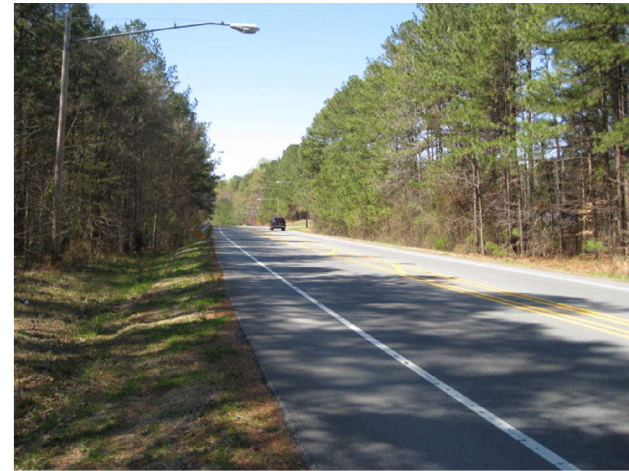
2. A1 – Heading southwest – Bike lanes are on both sides.