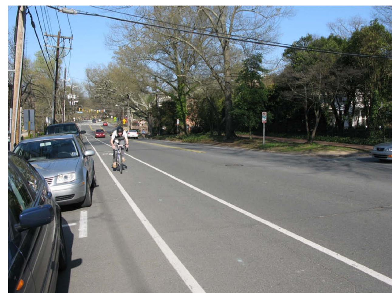
31. B7 – North side of University Square at Cameron Ave. looking west.