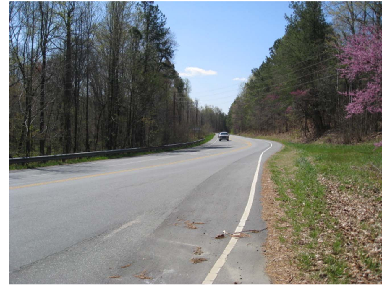
4. A2 – Traveling south on Estes Dr. extension, just south of Seawell Sch. Rd. intersection – bike lanes are on both sides.