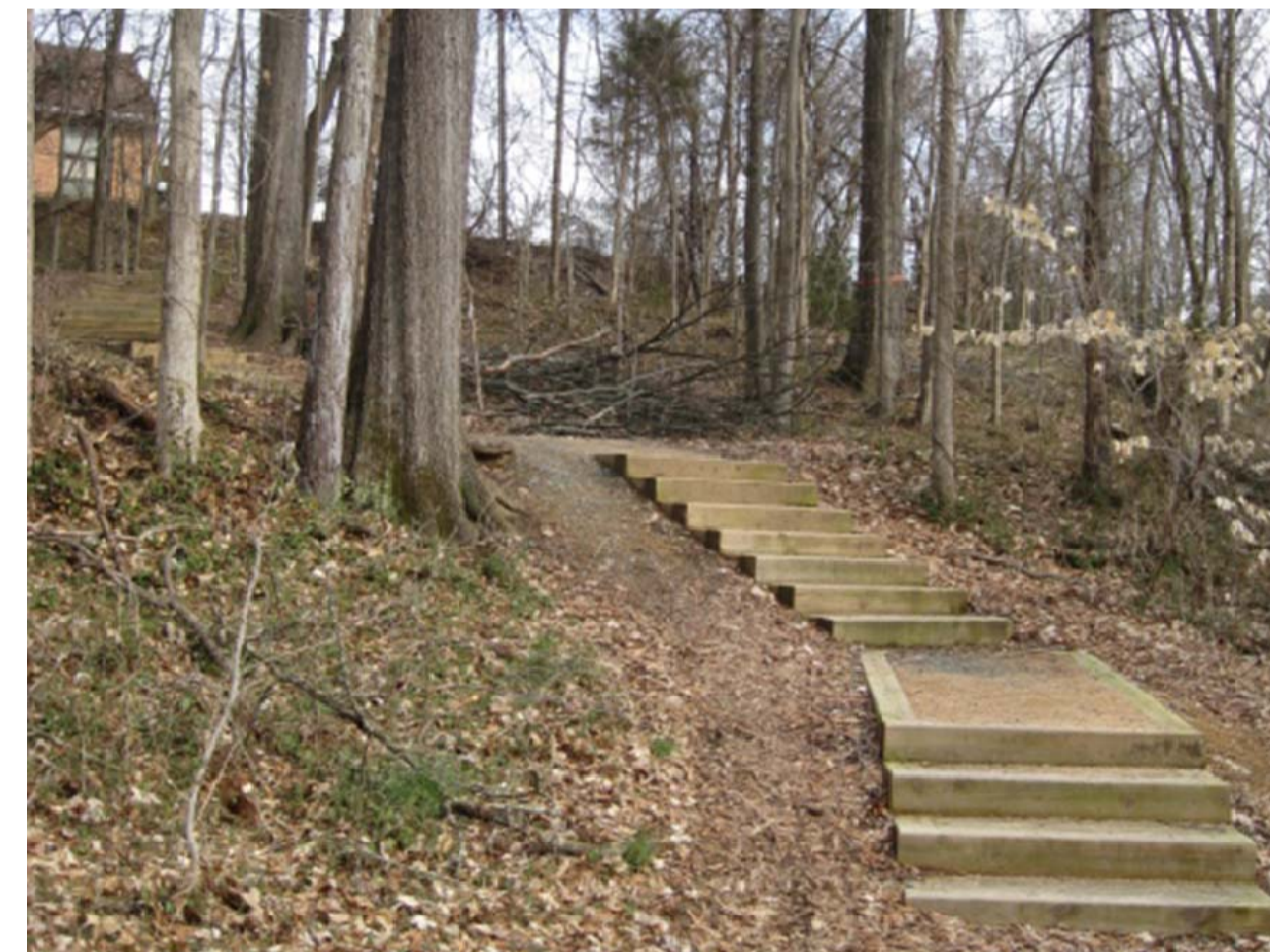
20. B2 – Caldwell to Mitchell and Caldwell to Church route - traveling south – steps up to school.