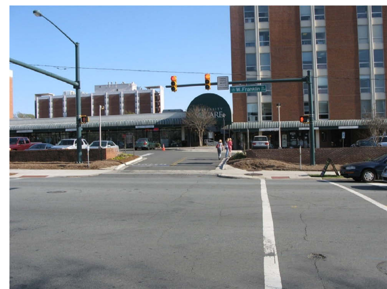
30. B4a – Church St./Franklin St. intersection at University square. Explore potential to locate a route through the property to Cameron Ave.