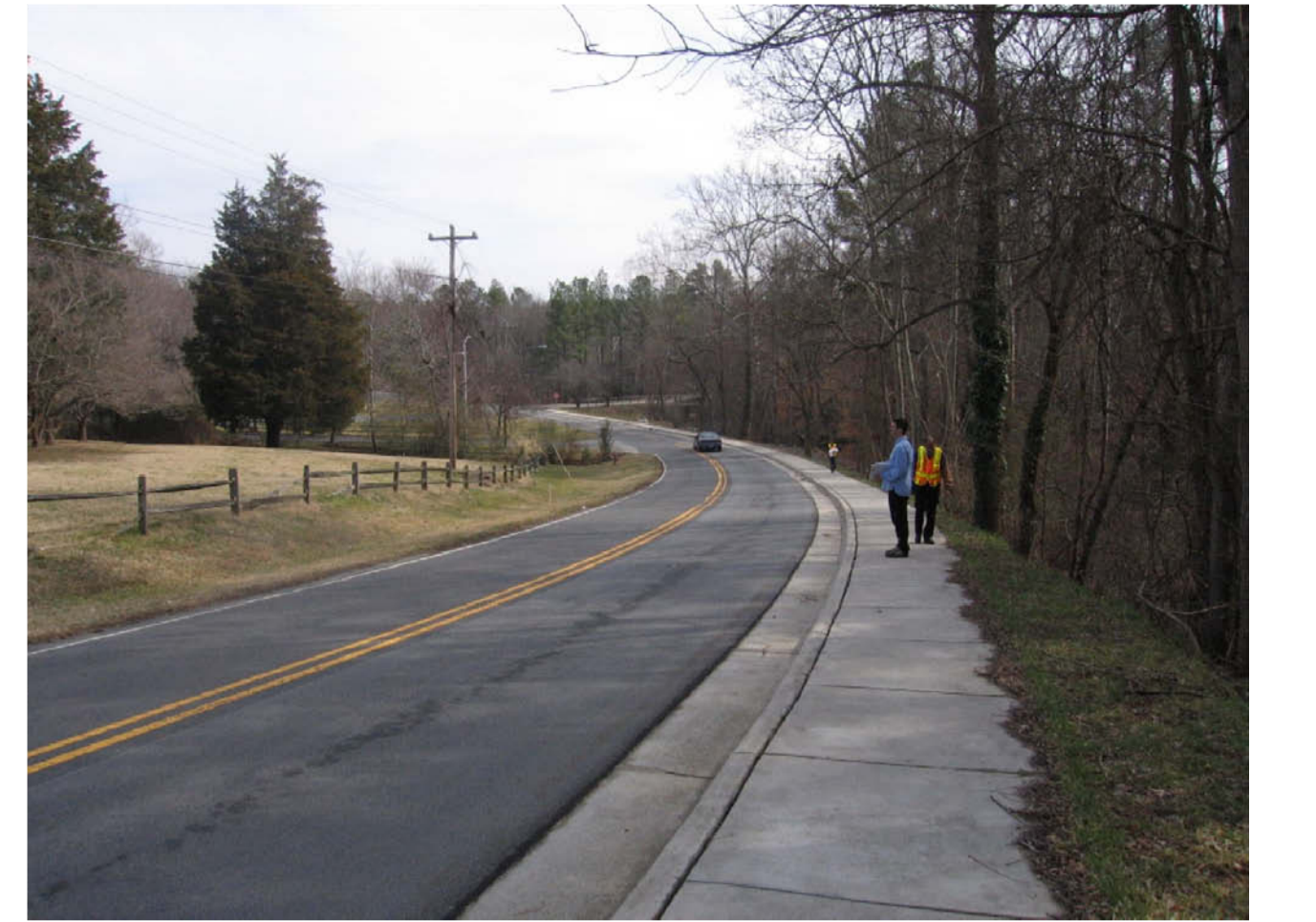
6. B1 – Heading south on Umstead Drive.