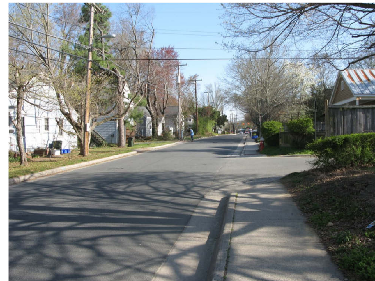
22. B4 – Caldwell St./Church Route - Church St. heading south.