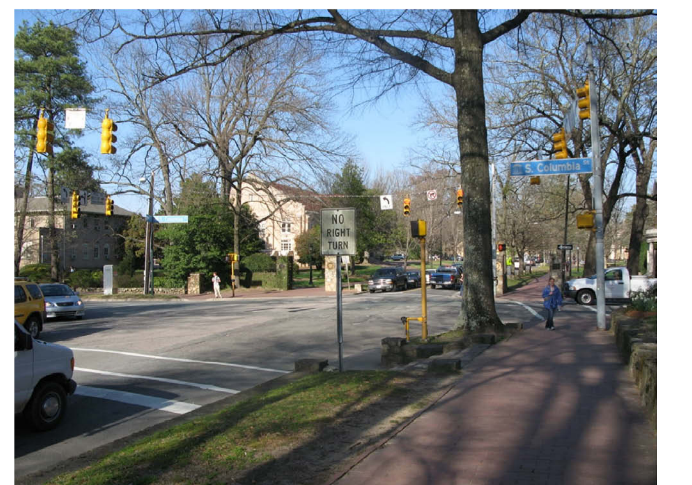
32. B7 – Intersection of S. Columbia St./Cameron Ave. – heading west to end point.