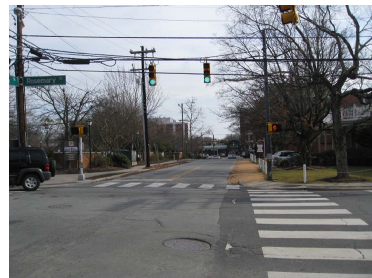
29. B4 – Intersection of Rosemary St. and Church St. heading south on Church towards University Square. All 3 suggested routes from Tanbark Trail converge here.