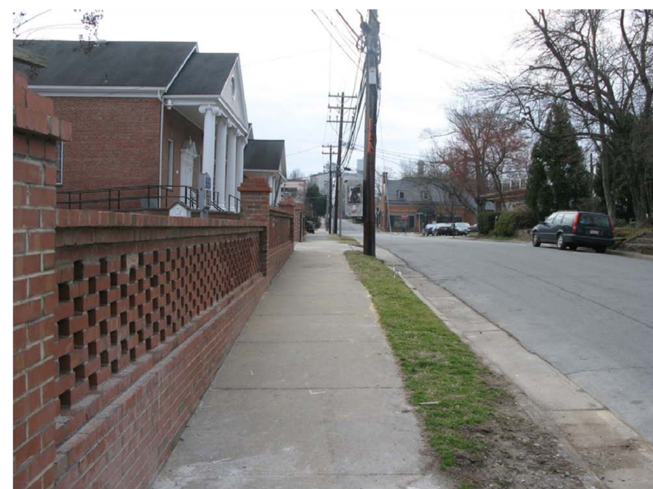
26. B7 – Mitchell/Rosemary/Roberson/Cameron St. Route - Roberson St. between Rosemary and Franklin - looking South