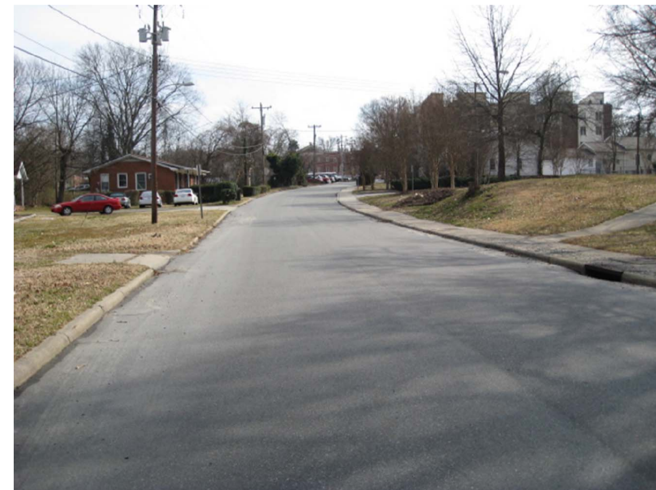
24. B6 – Mitchell Lane heading south towards Rosemary St.