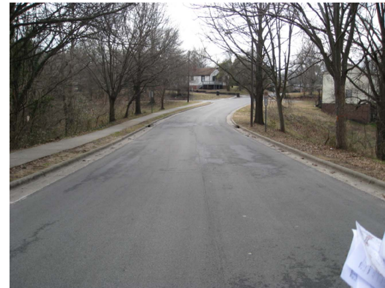
23. B5 – Caldwell to Mitchell route - Caldwell St. heading south west towards Mitchell St.