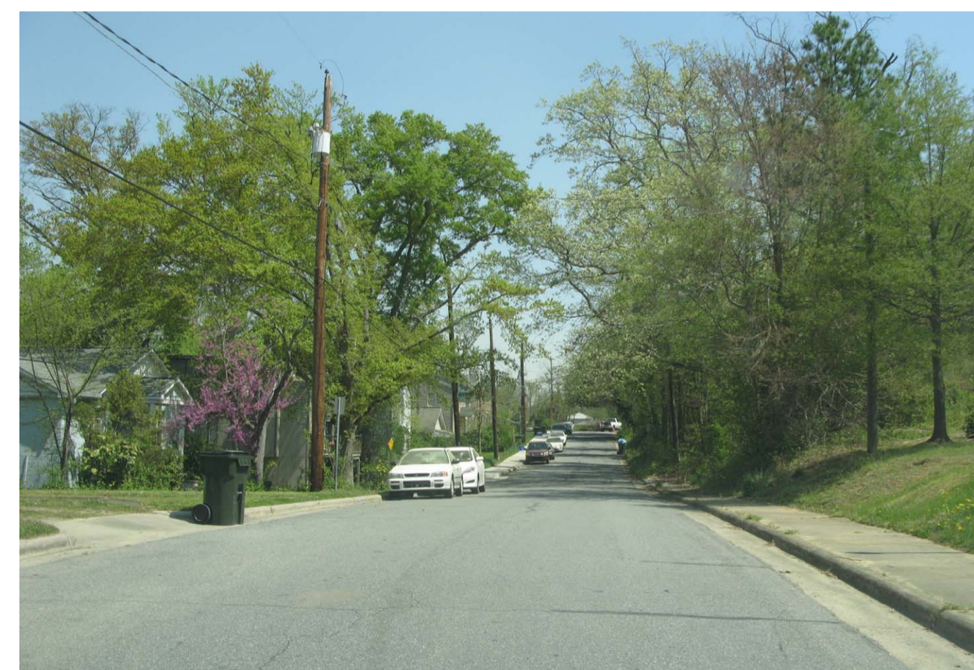
16. B3 – McMasters/Church St. route – on McMasters heading west.