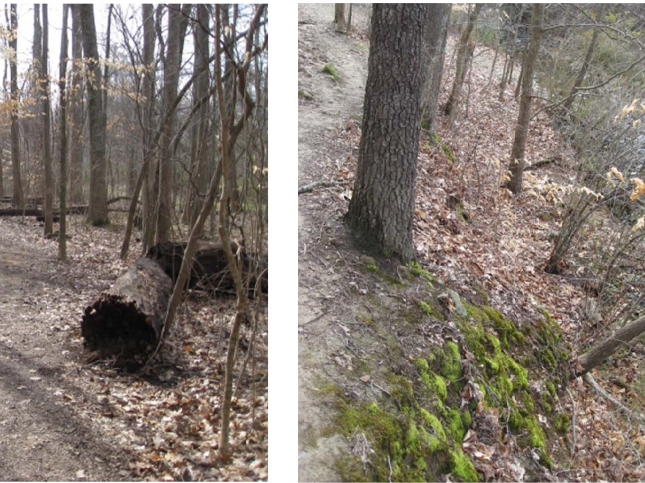
11. B1 – Tanbark Trail heading south.