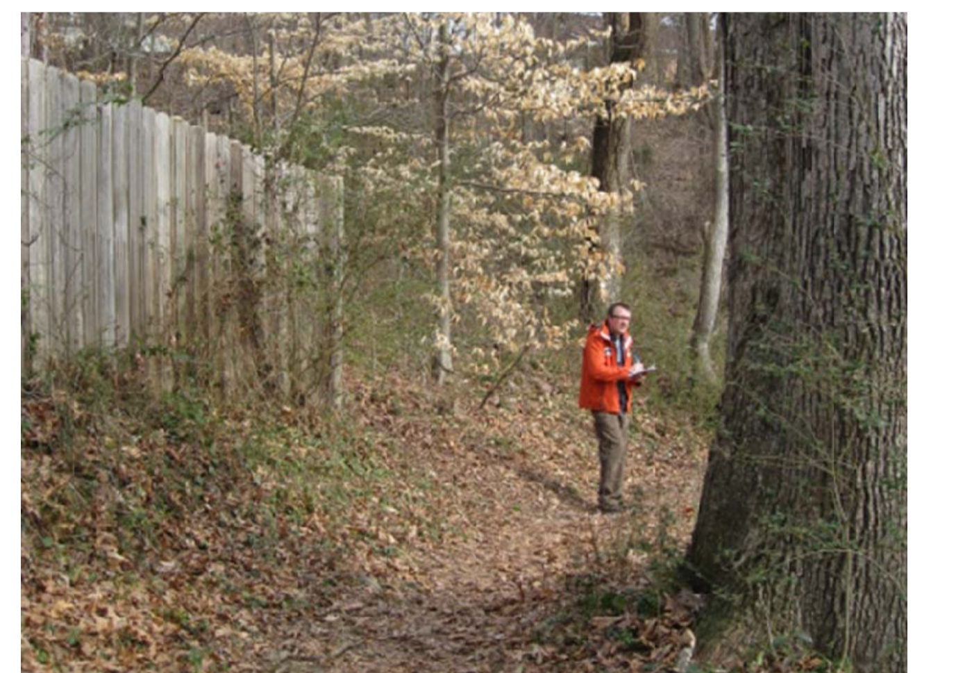
19. B2 – Caldwell to Mitchell and Caldwell to Church Route - traveling south west - pathway narrows between neighbor's fence and stream below walker in orange.