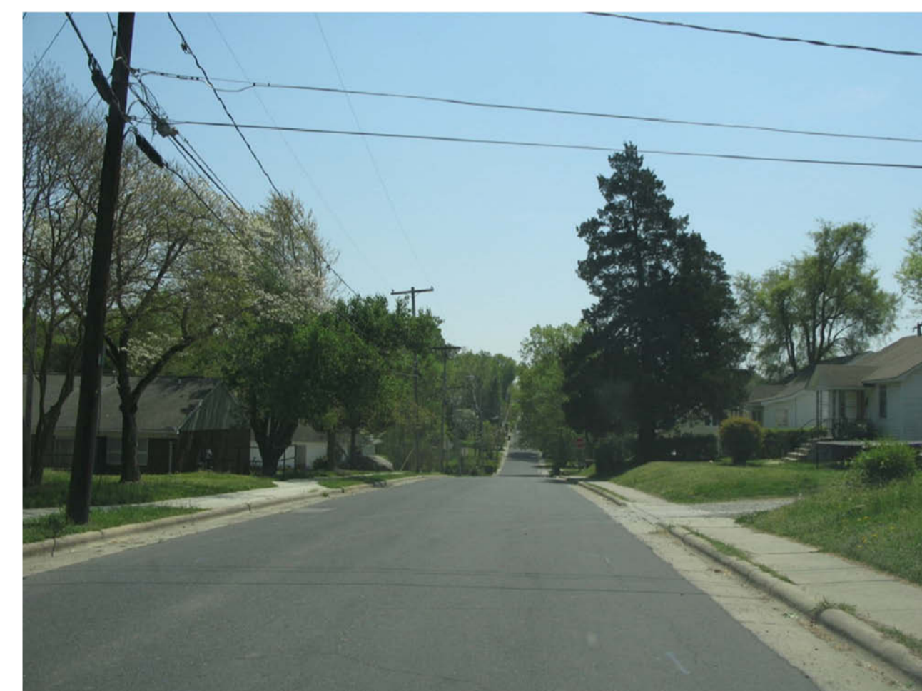
17. B4 – Church street at north end – heading south towards Rosemary St.