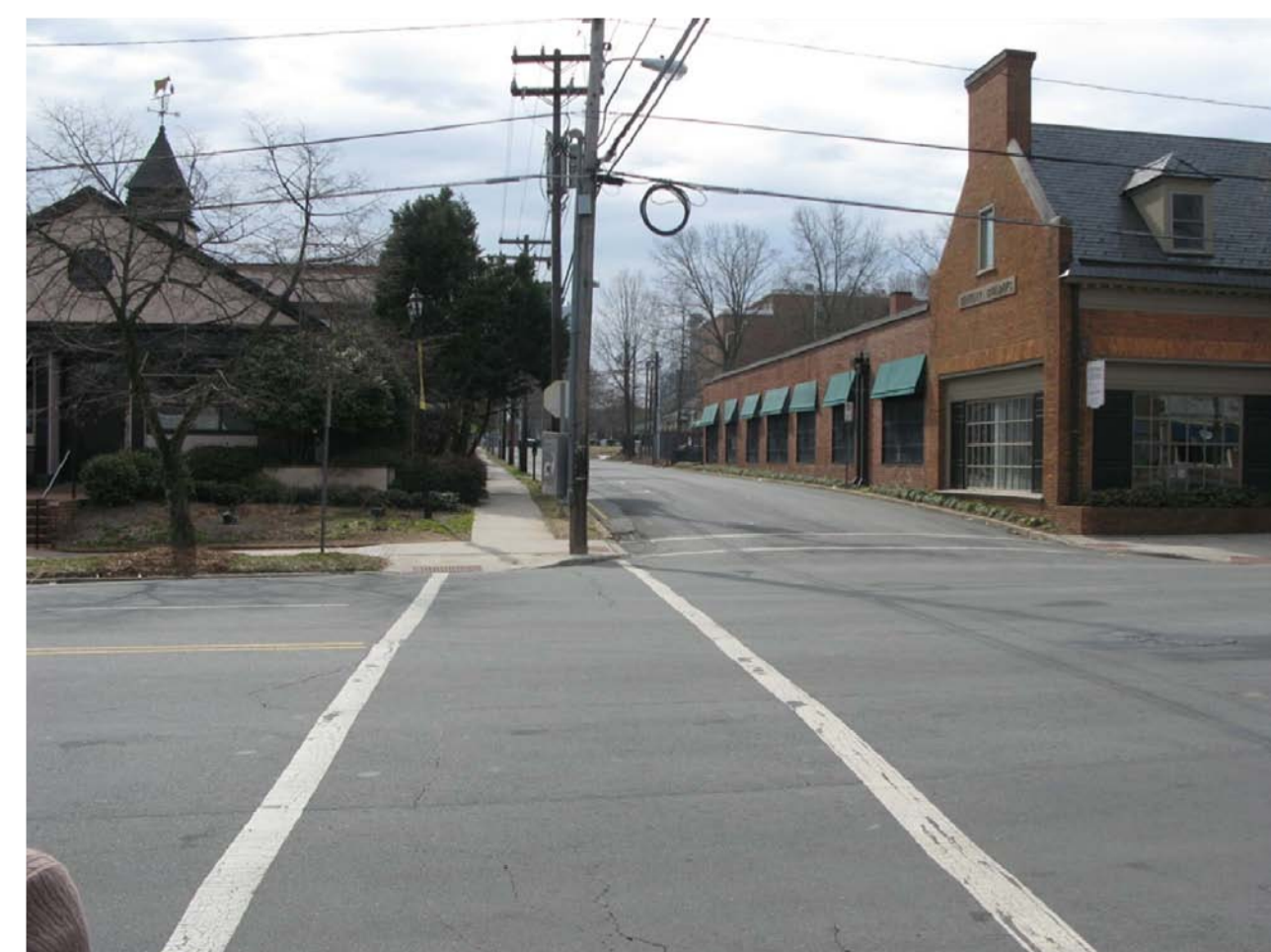
27. B7 – Mitchell/Rosemary/Roberson/Cameron Route – Roberson St. at Franklin St. heading south to Cameron Ave.