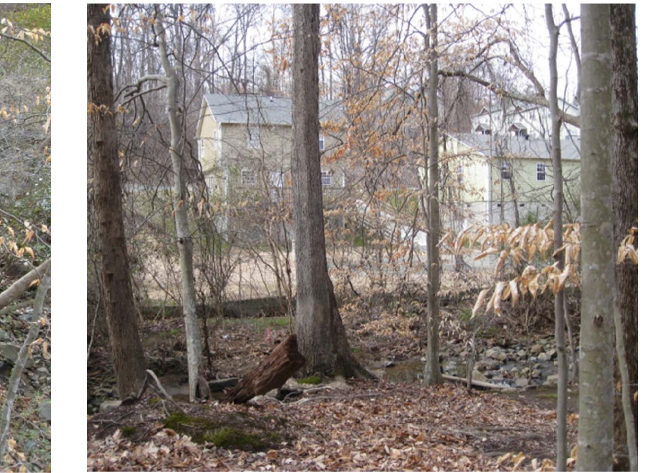
13. B2 – Tanbark trail heading south – view across stream and to houses on Jay St.