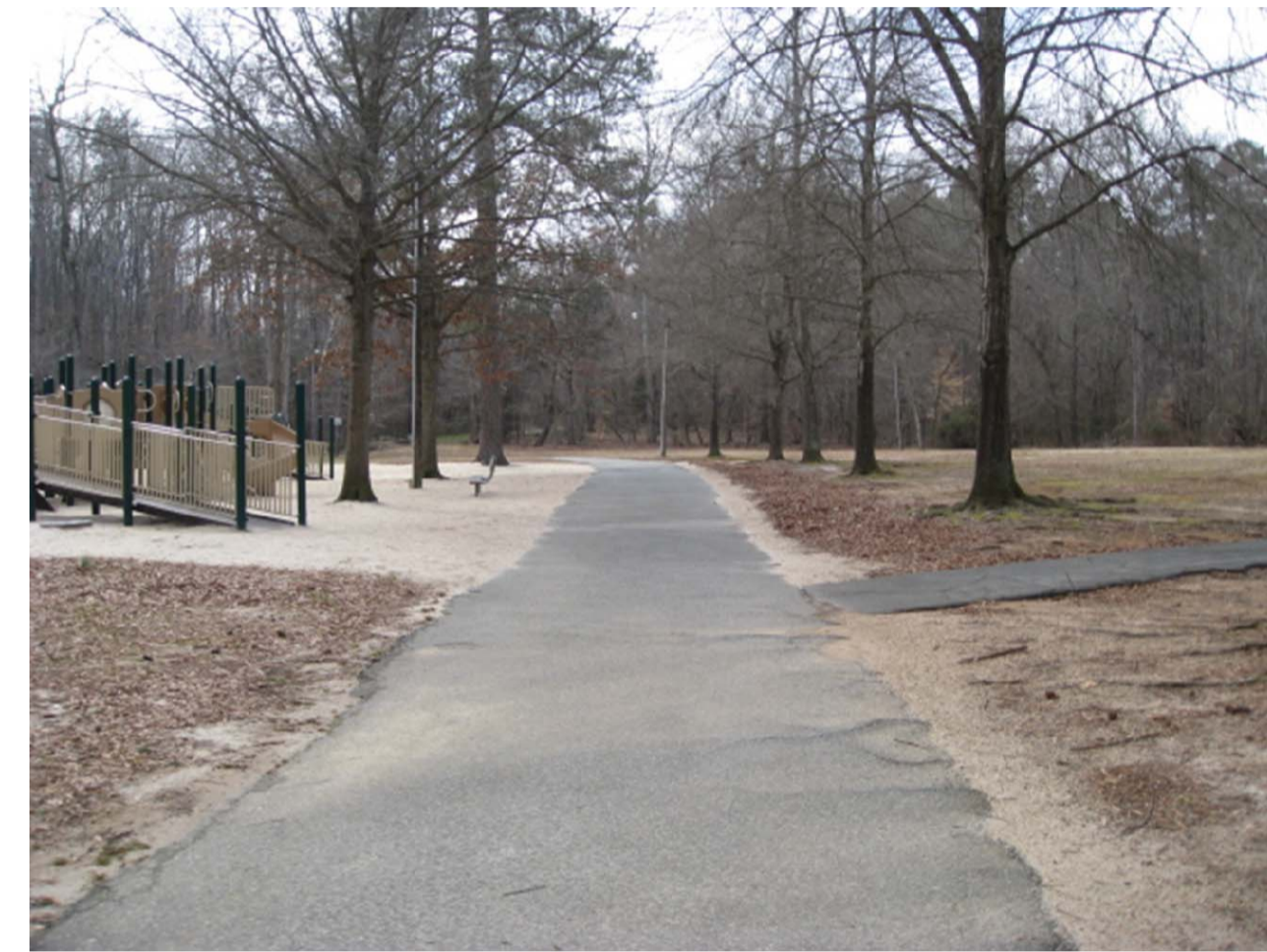
9. B2 – Heading south through Umstead Park on asphalt sidewalk.