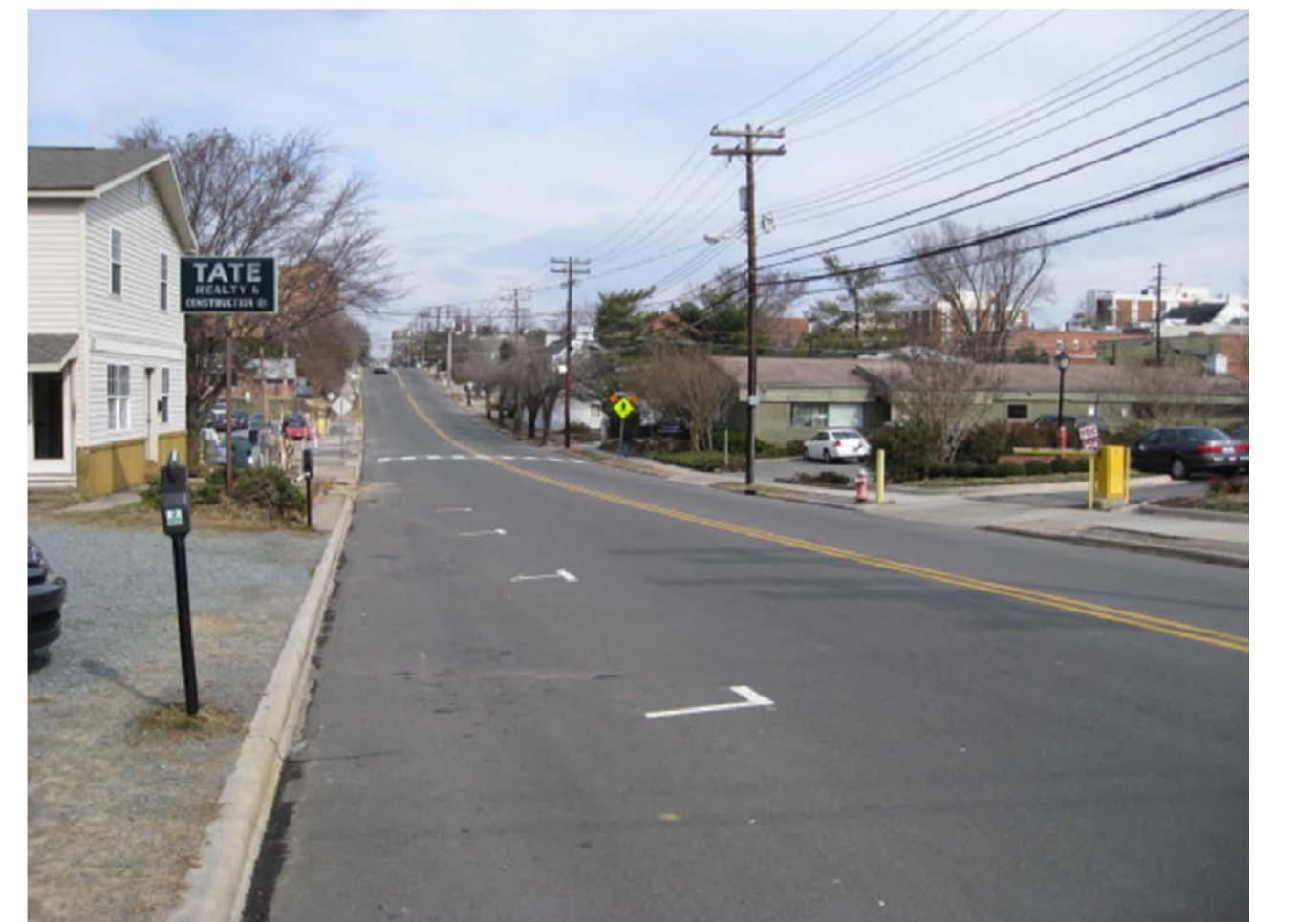
25. B6 route – Intersection of Mitchell and Rosemary St. – heading east. We diverge from suggested route because we think that heading towards east towards Church St. is closer to the end point (than traveling west to Roberson).