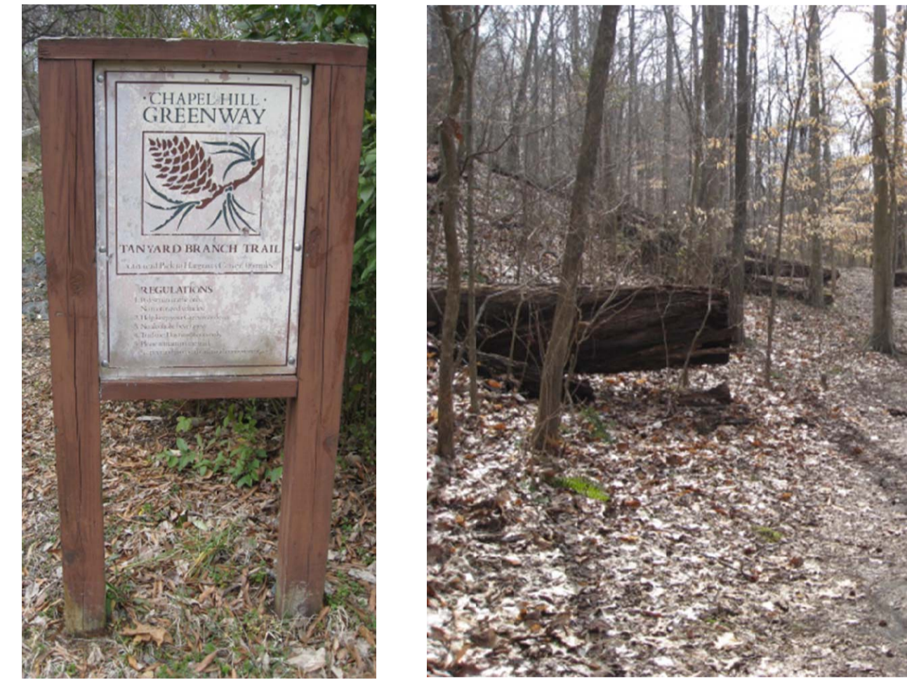
10. B2 – Tanbark Trail heading south