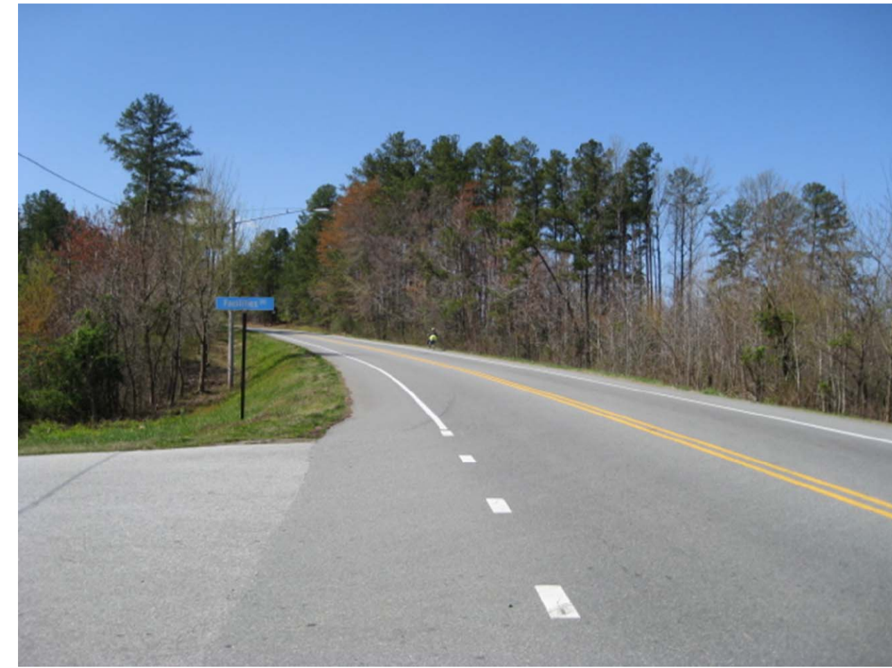
1. A1 – Starting Point at intersection of Facilities Drive/Estes Dr. Extension – heading southwest. Bike lanes are on both sides.

Estimated distance for Route B is 2.82 Miles (14888.05 feet).