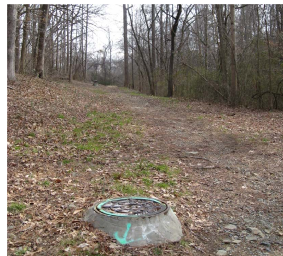
14. B2 – Route heads south east and joins OWASA easement.