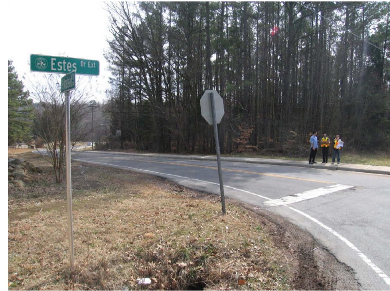
5. B1 – Intersection of Estes Dr. Extension/Umstead Road – route turns south east onto Umstead Road - No crosswalk on Umstead Dr. – sidewalk on south side.